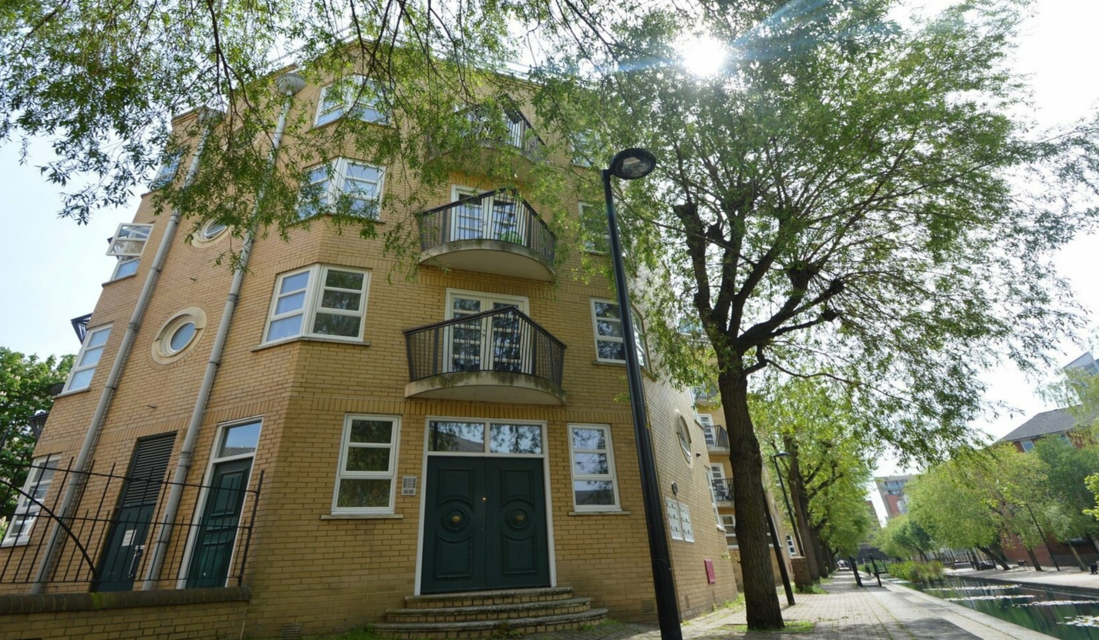
MONKTON HOUSE SE16 1 bedroom apartment