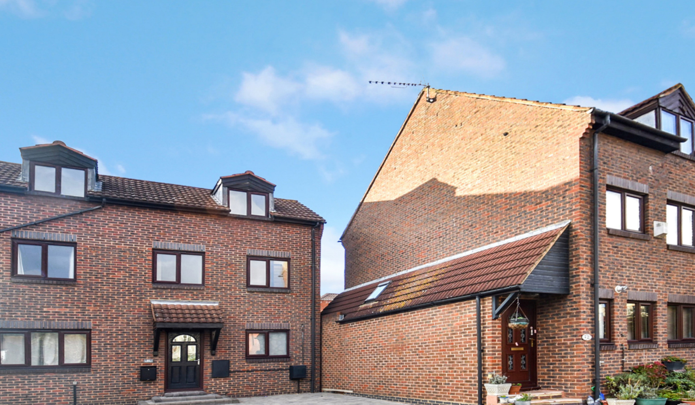
STEERS WAY SE16 3 bedroom detached house