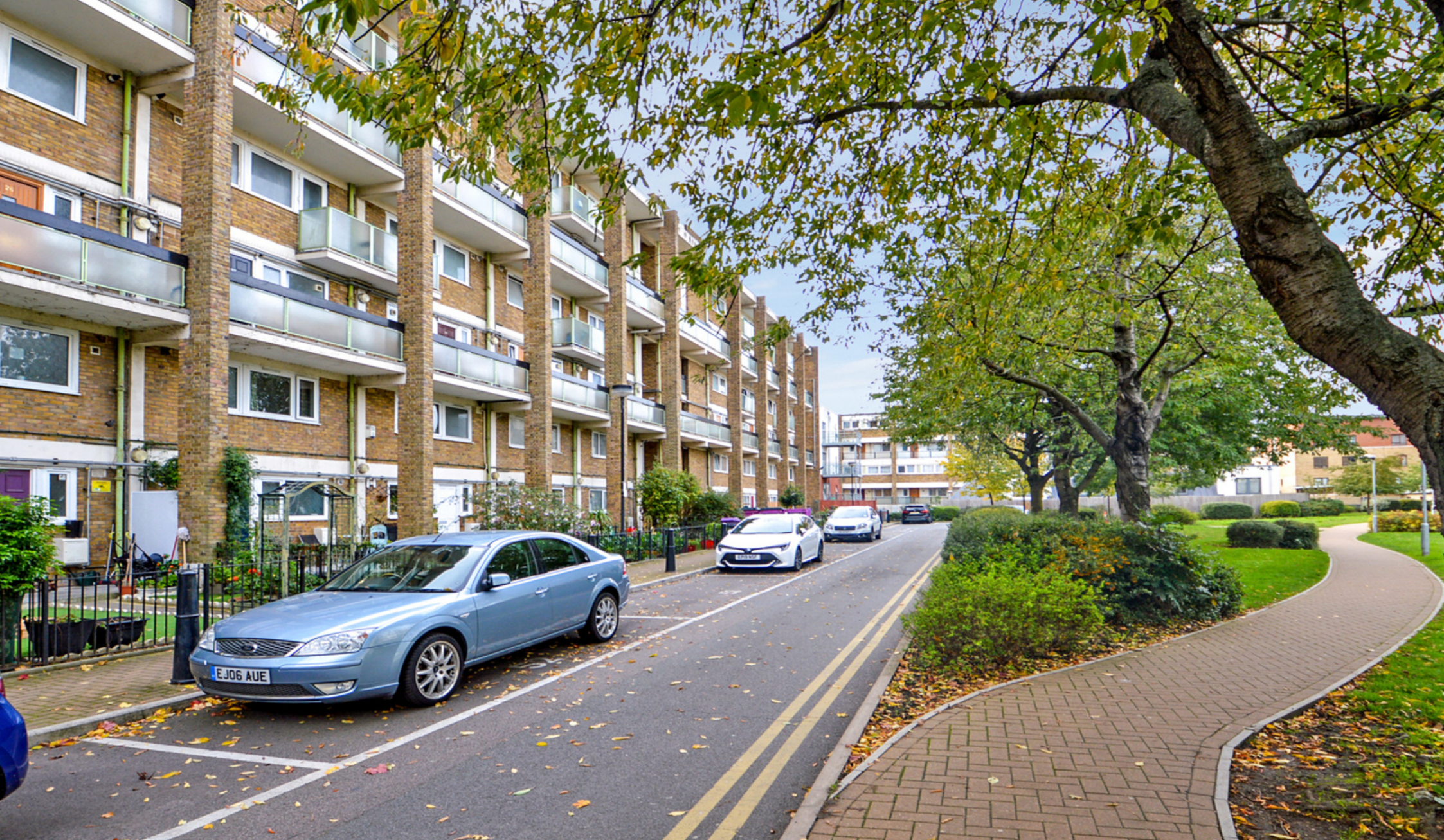
DERWENT HOUSE E3 2 bedroom duplex apartment