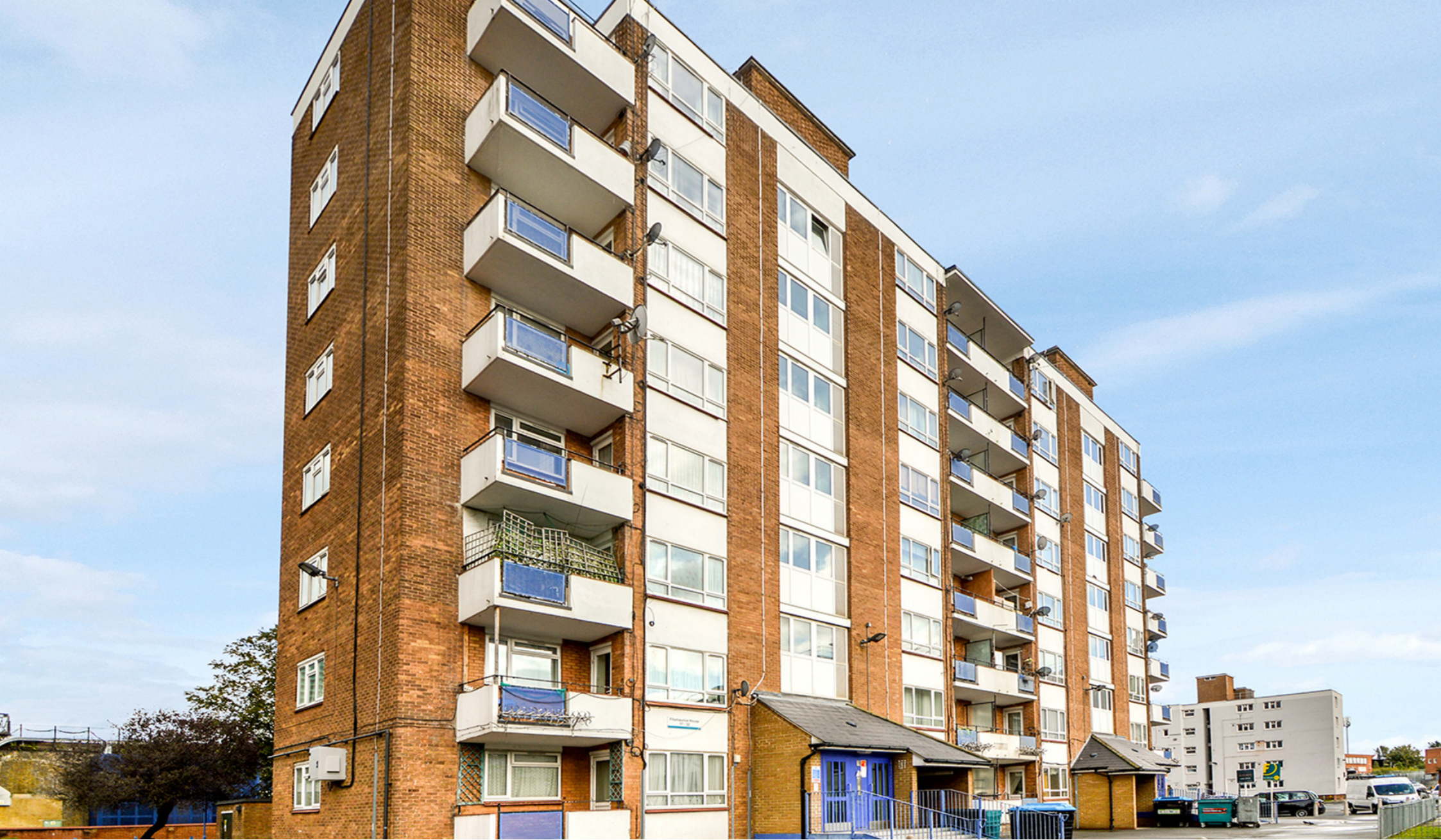
FITZMAURICE HOUSE SE16 3 bedroom apartment