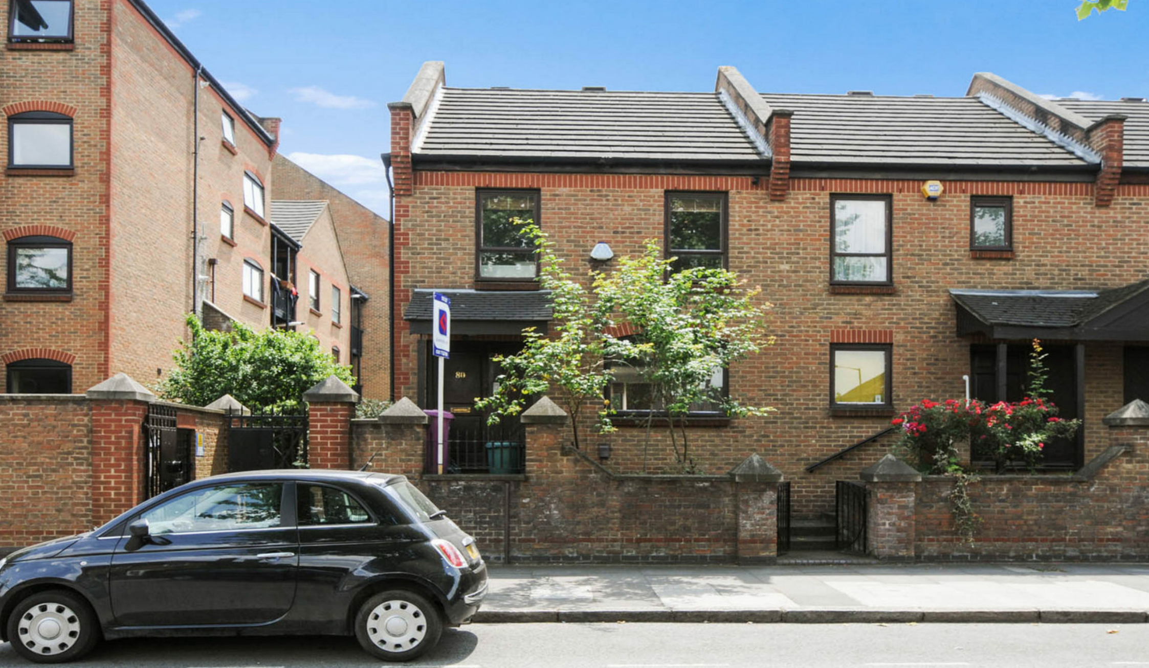
MANCHESTER ROAD E14 3 bedroom terraced house