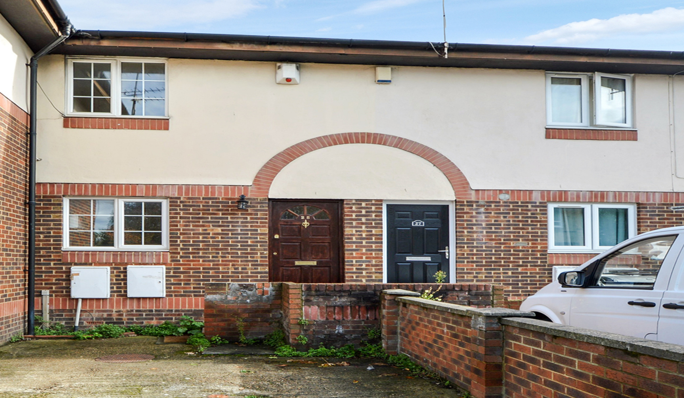
CHAUCER DRIVE SE1 2 bedroom terraced house