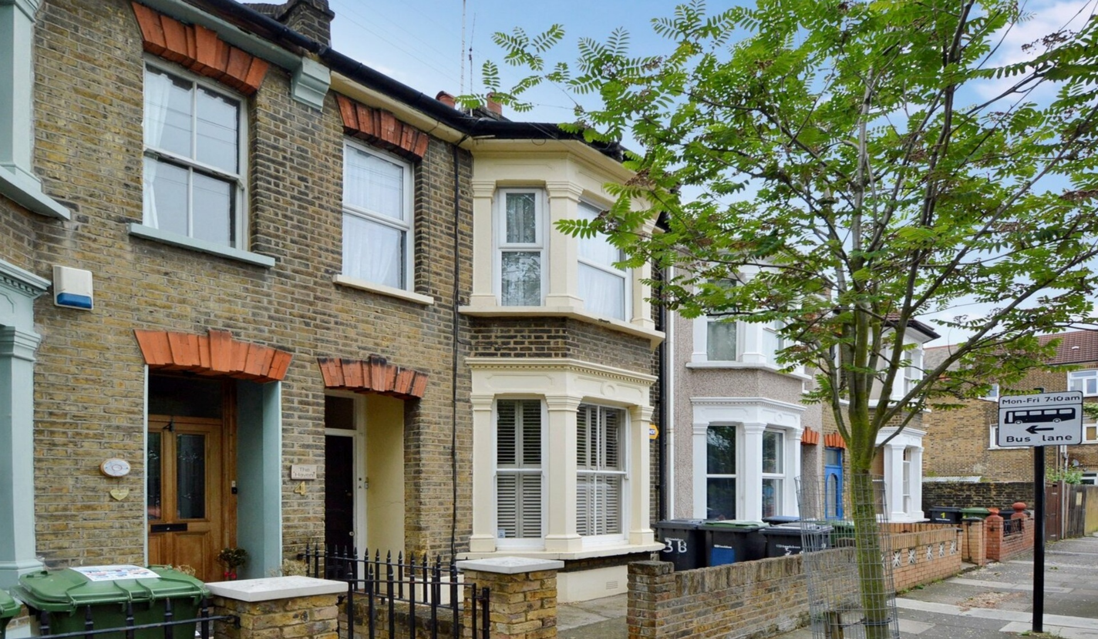
SCAWEN ROAD SE8 1 bedroom apartment