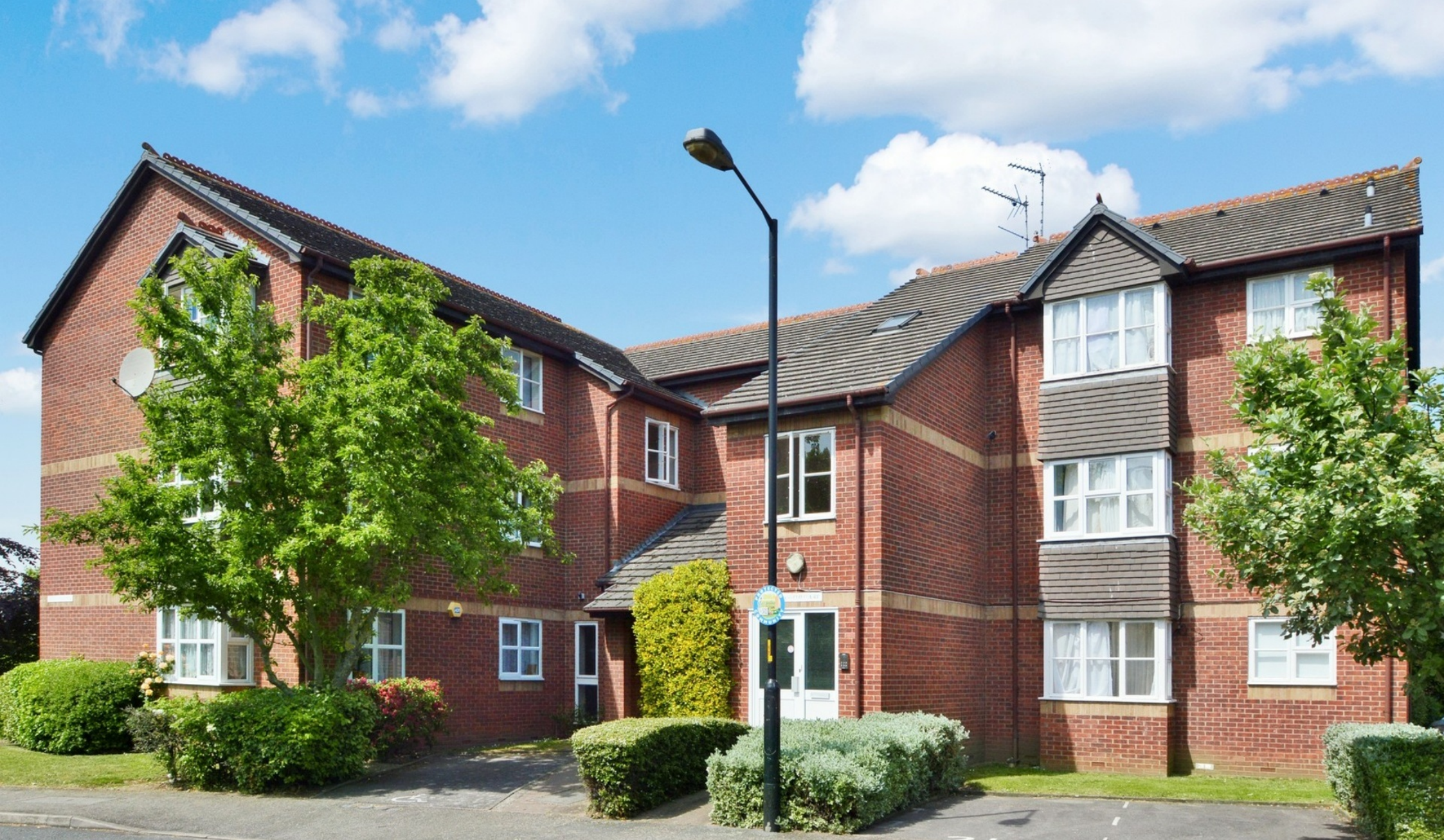
MICHELANGELO COURT SE16 2 bedroom apartment