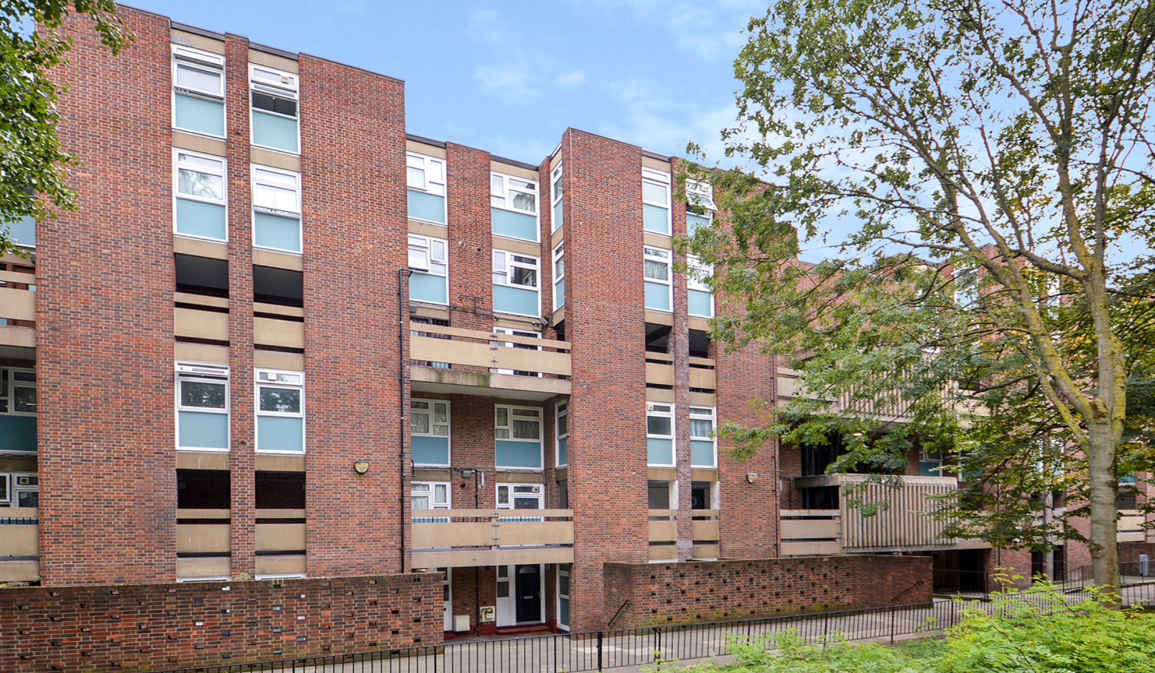
WYNDHAM DEEDES HOUSE E2 2 bedroom maisonette