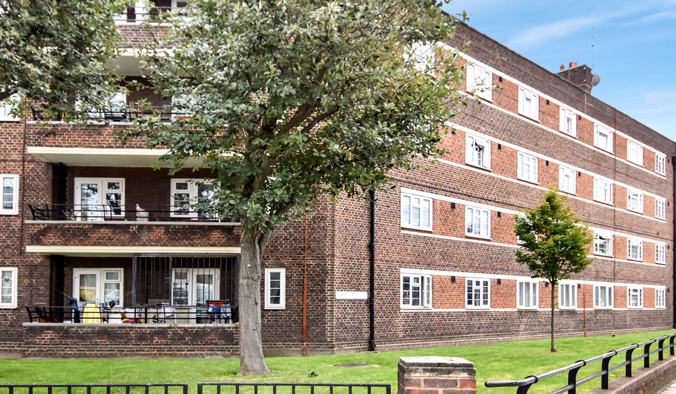
MORAY HOUSE E1 3 bedroom maisonette