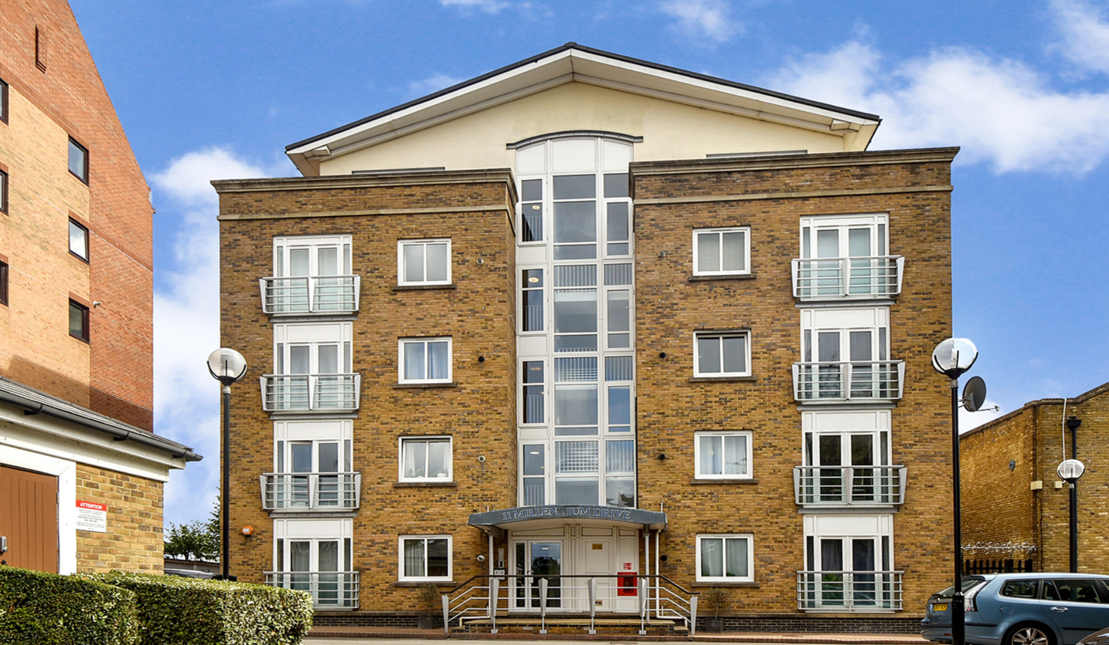
MILLENNIUM DRIVE E14 2 bedroom apartment