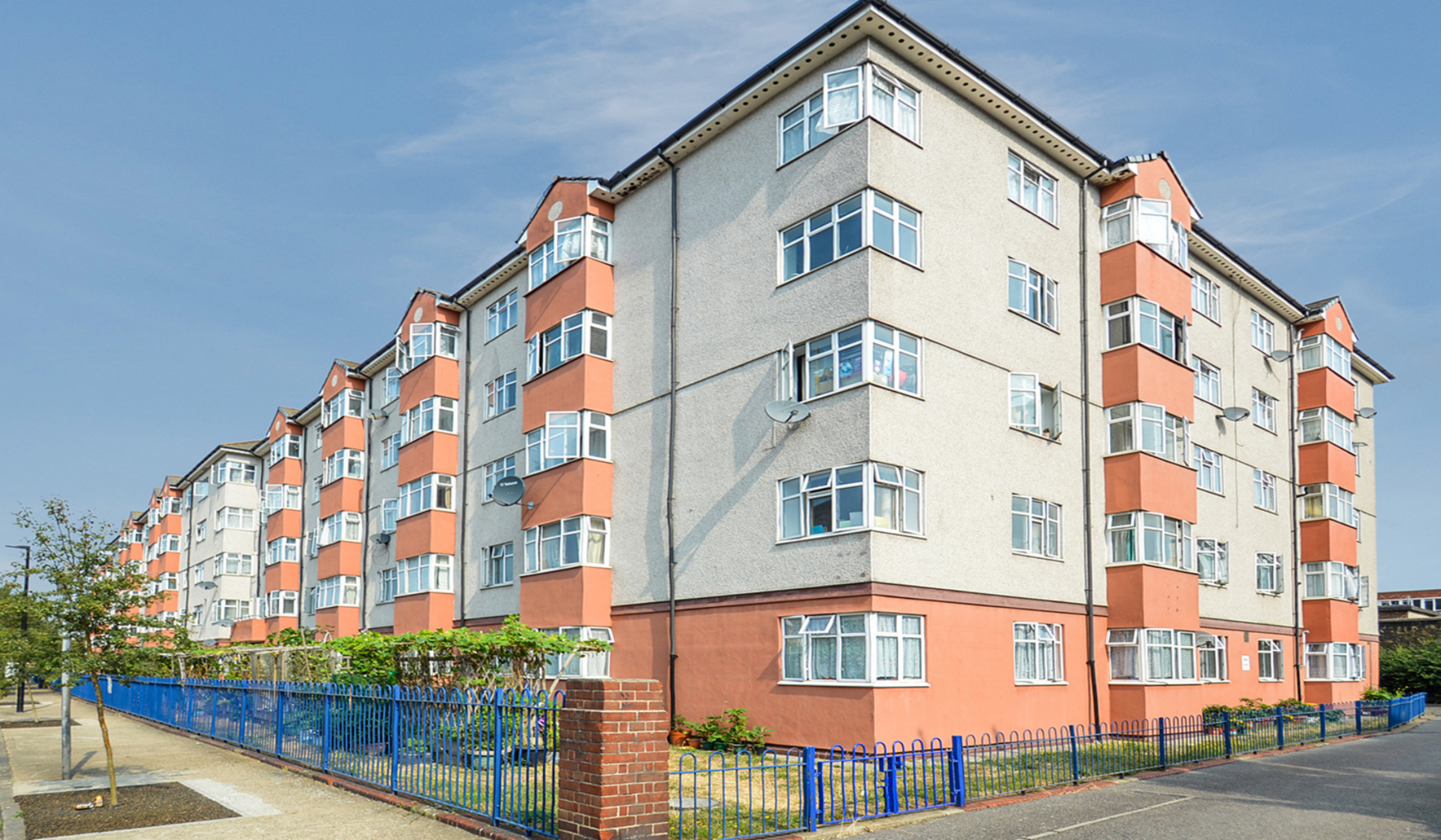
OBAN HOUSE E14 3 bedroom apartment