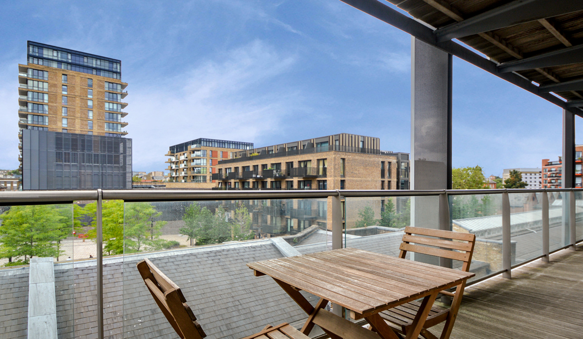
WEST CARRIAGE HOUSE SE18 3 bedroom apartment