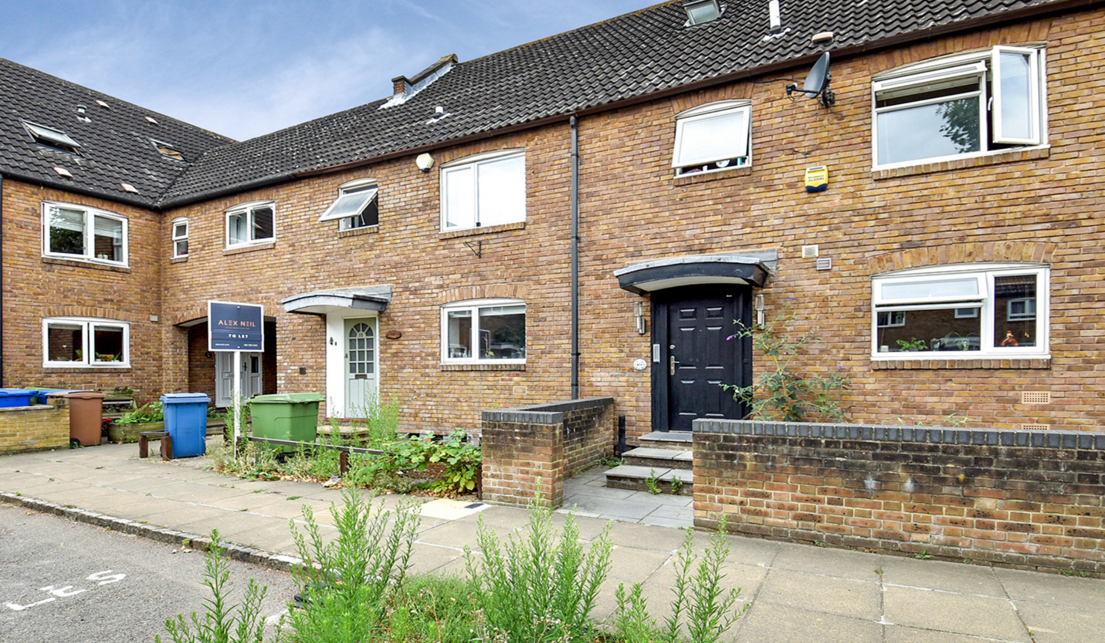
REDWOOD CLOSE SE16 3 bedroom terraced house