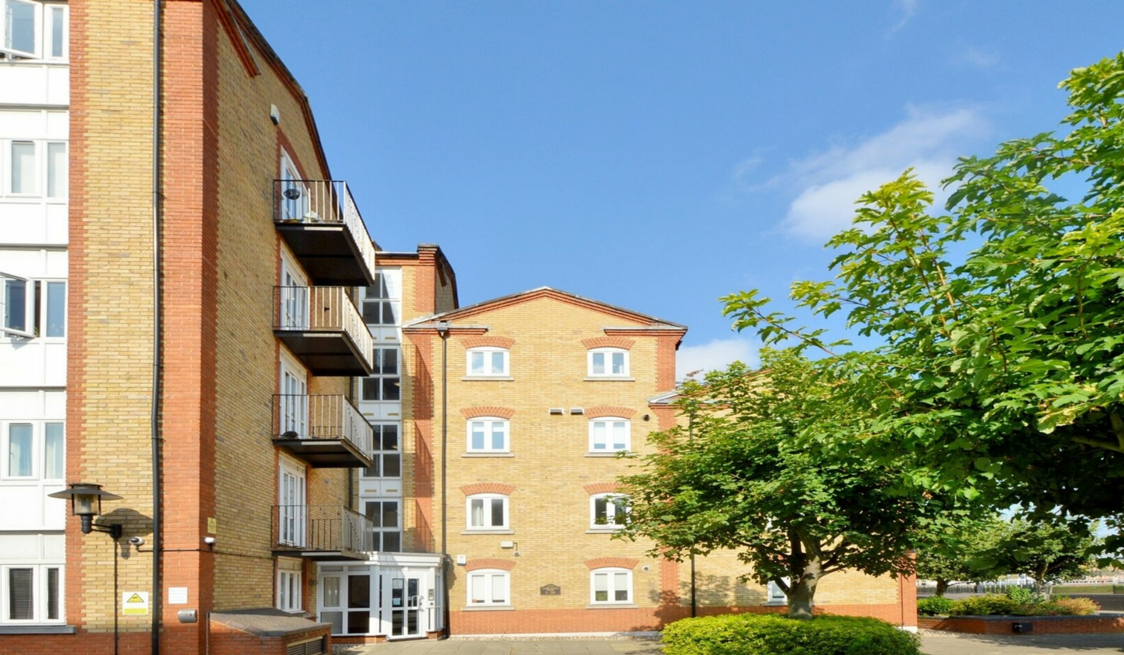
CODRINGTON COURT SE16 2 bedroom apartment