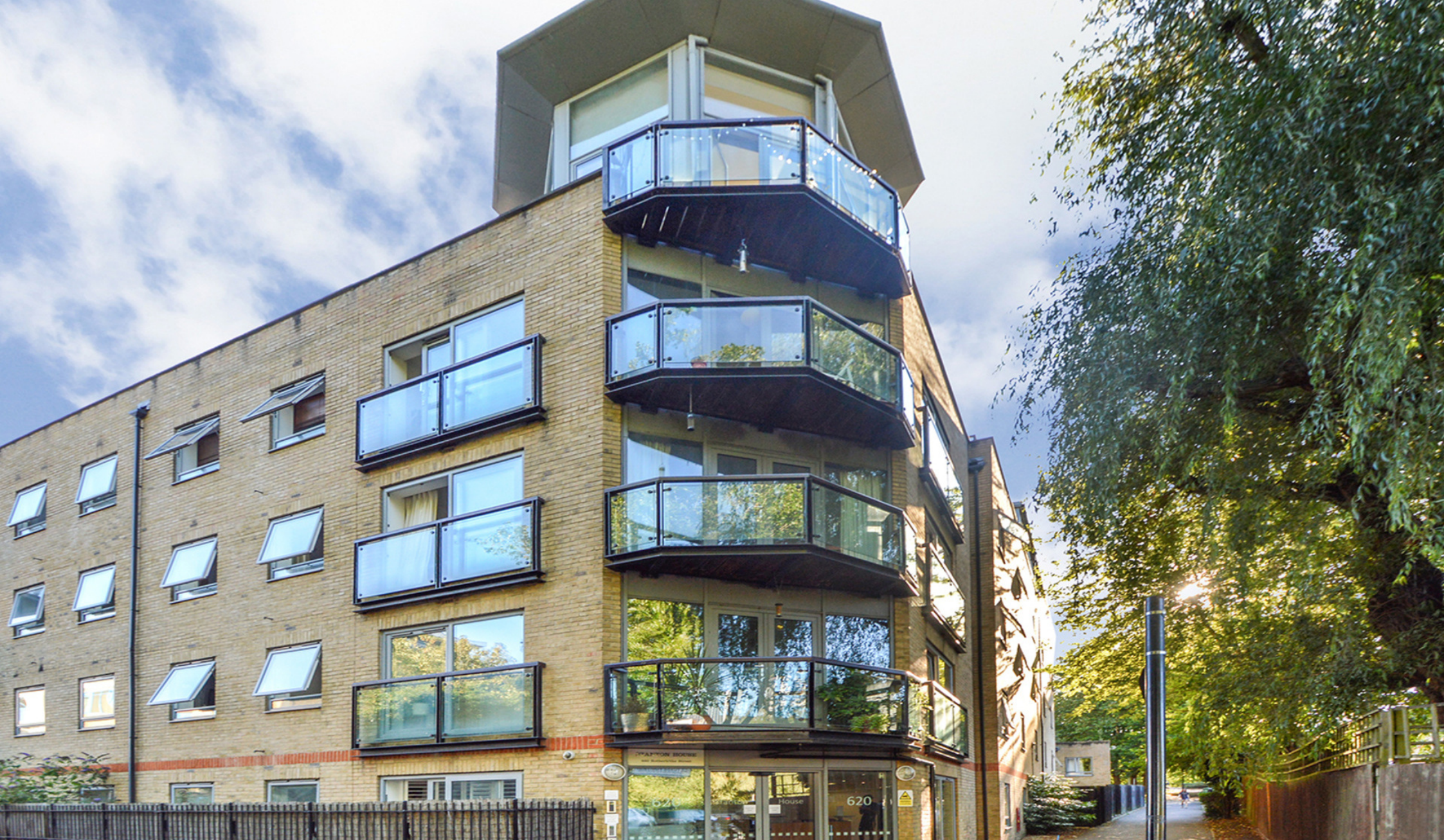
STANTON HOUSE SE16 2 bedroom apartment