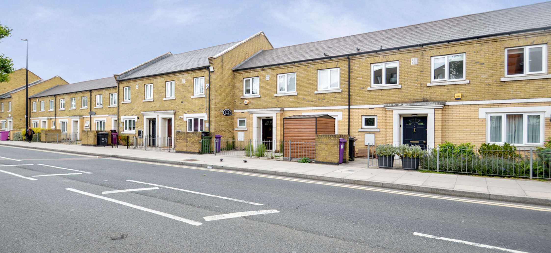
ABBOTT ROAD E14 2 bedroom terraced house