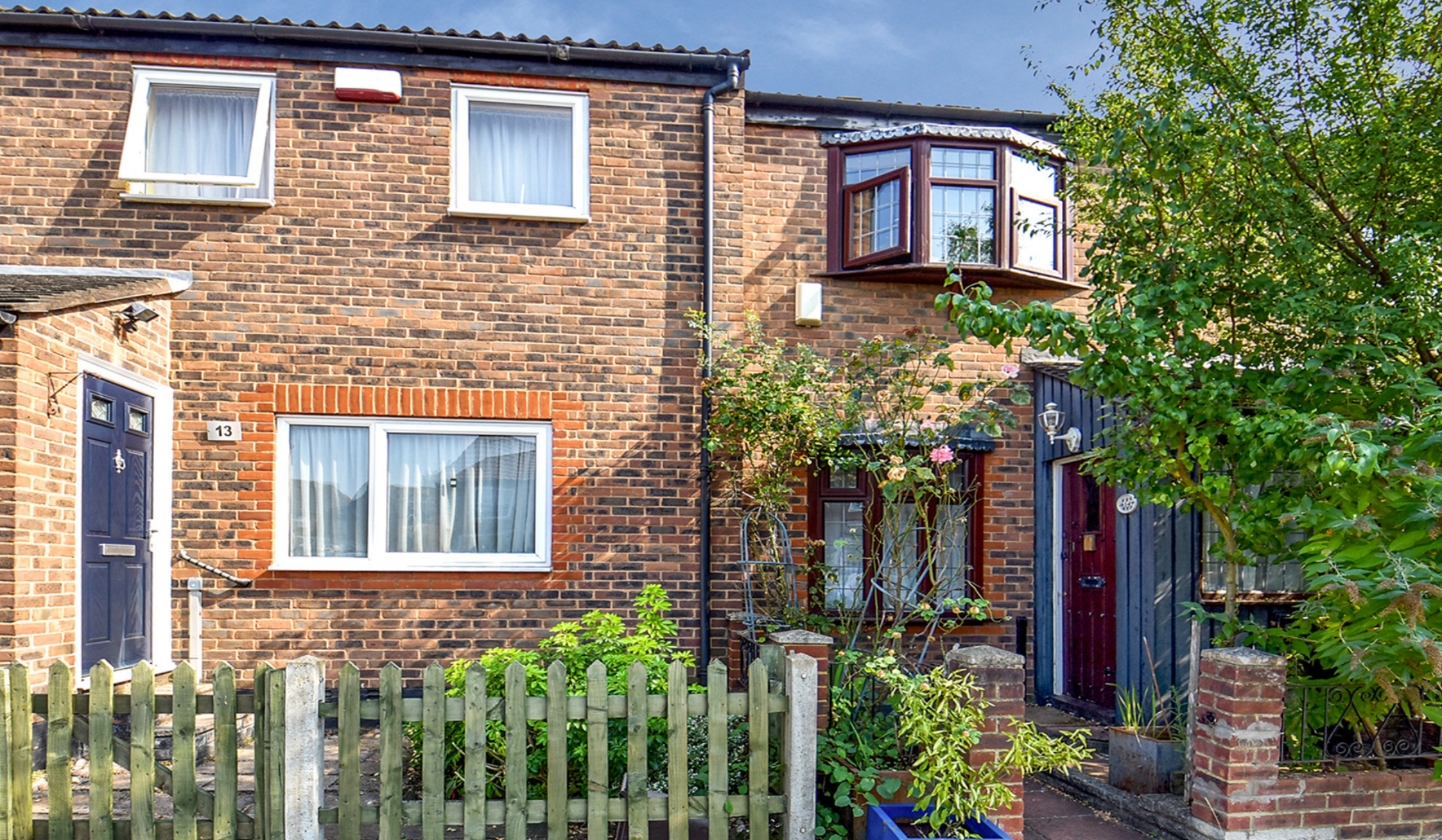
SHIPWRIGHT ROAD SE16 2 bedroom terraced house