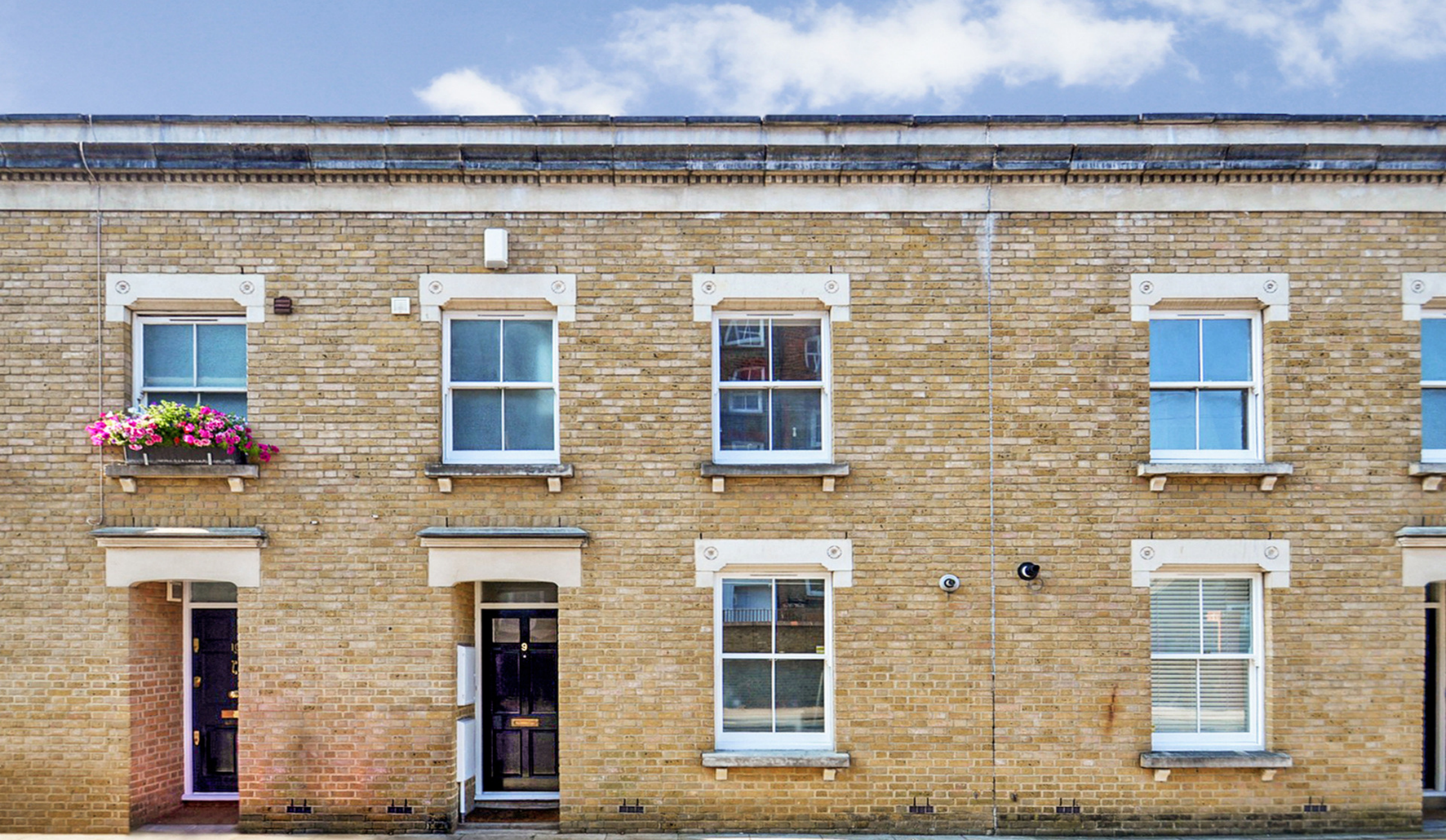
TWINE TERRACE E3 2 bedroom terraced house