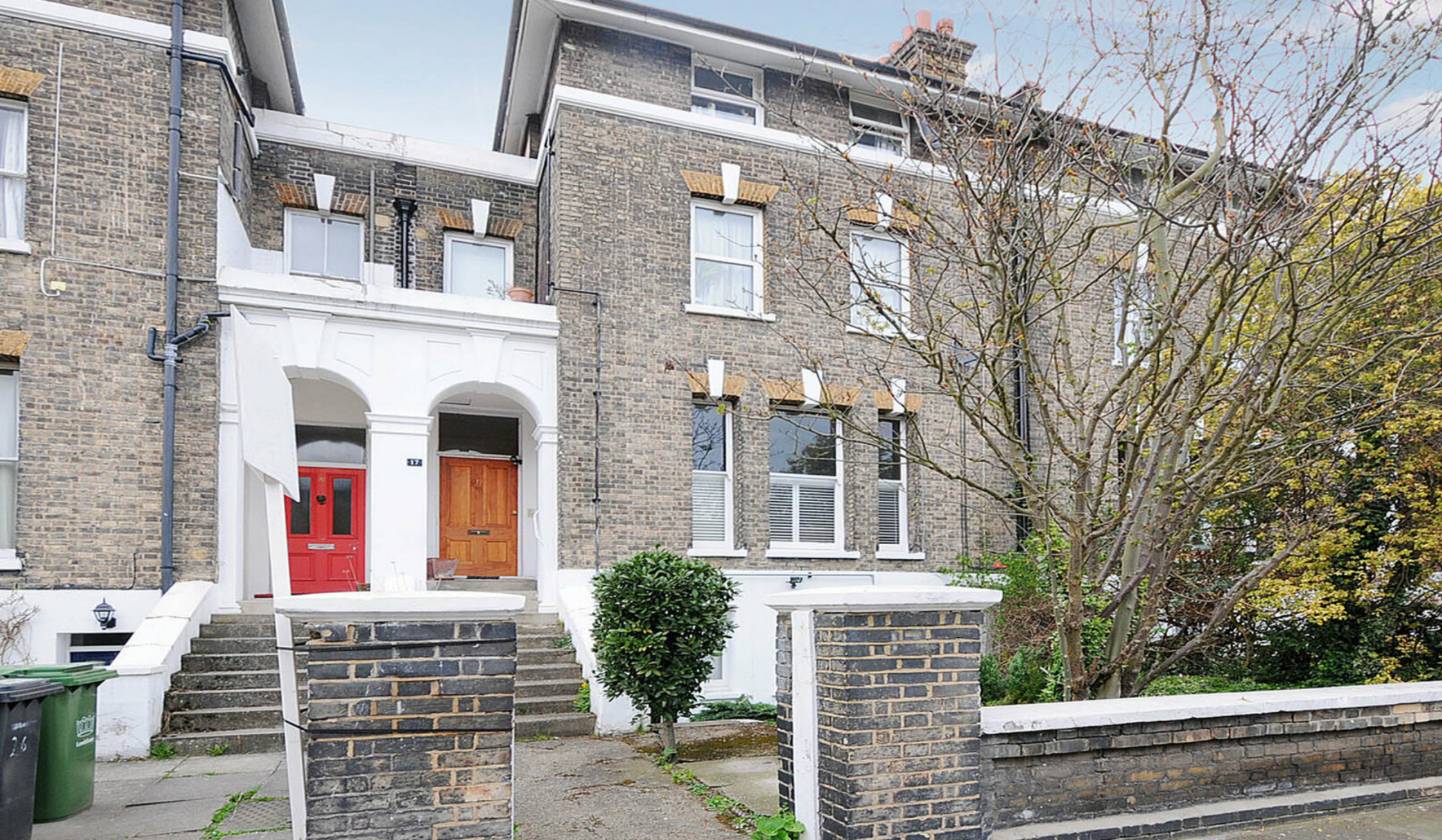
BLACKHEATH GROVE SE3 1 bedroom apartment