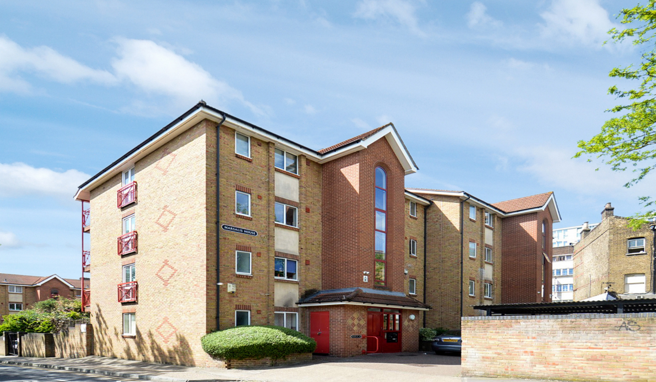
MARSALIS HOUSE E3 1 bedroom apartment