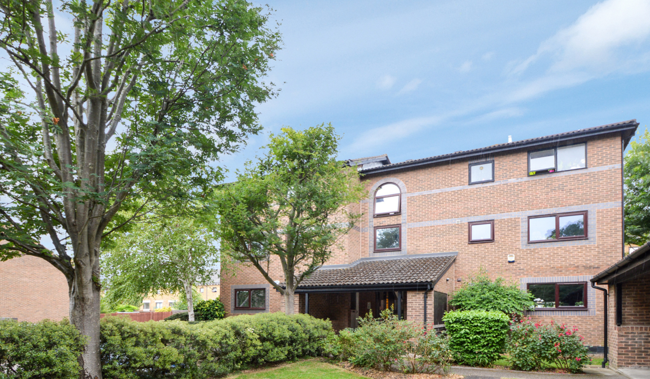
FARROW PLACE SE16 2 bedroom apartment