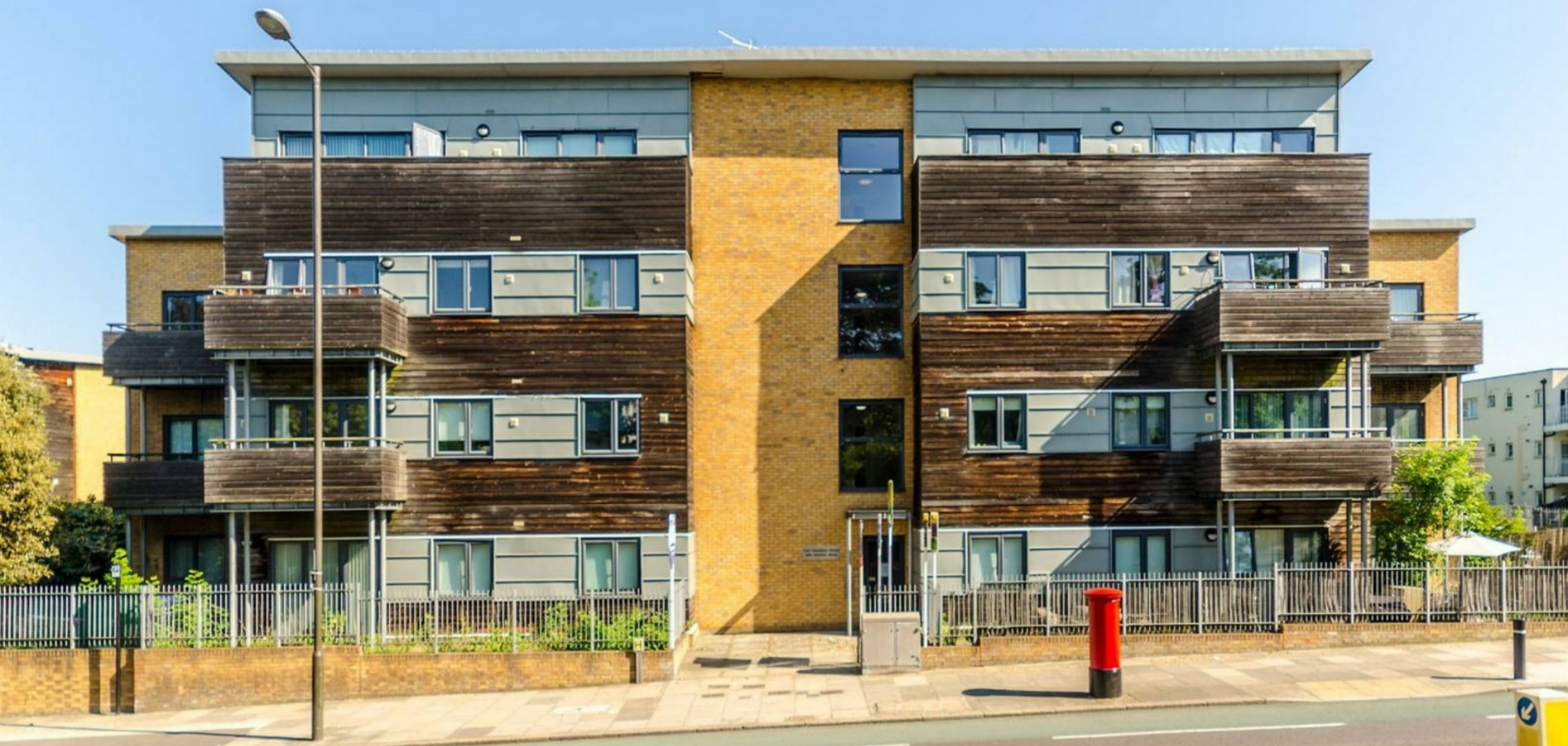
CHAMPION HOUSE SE7 1 bedroom apartment