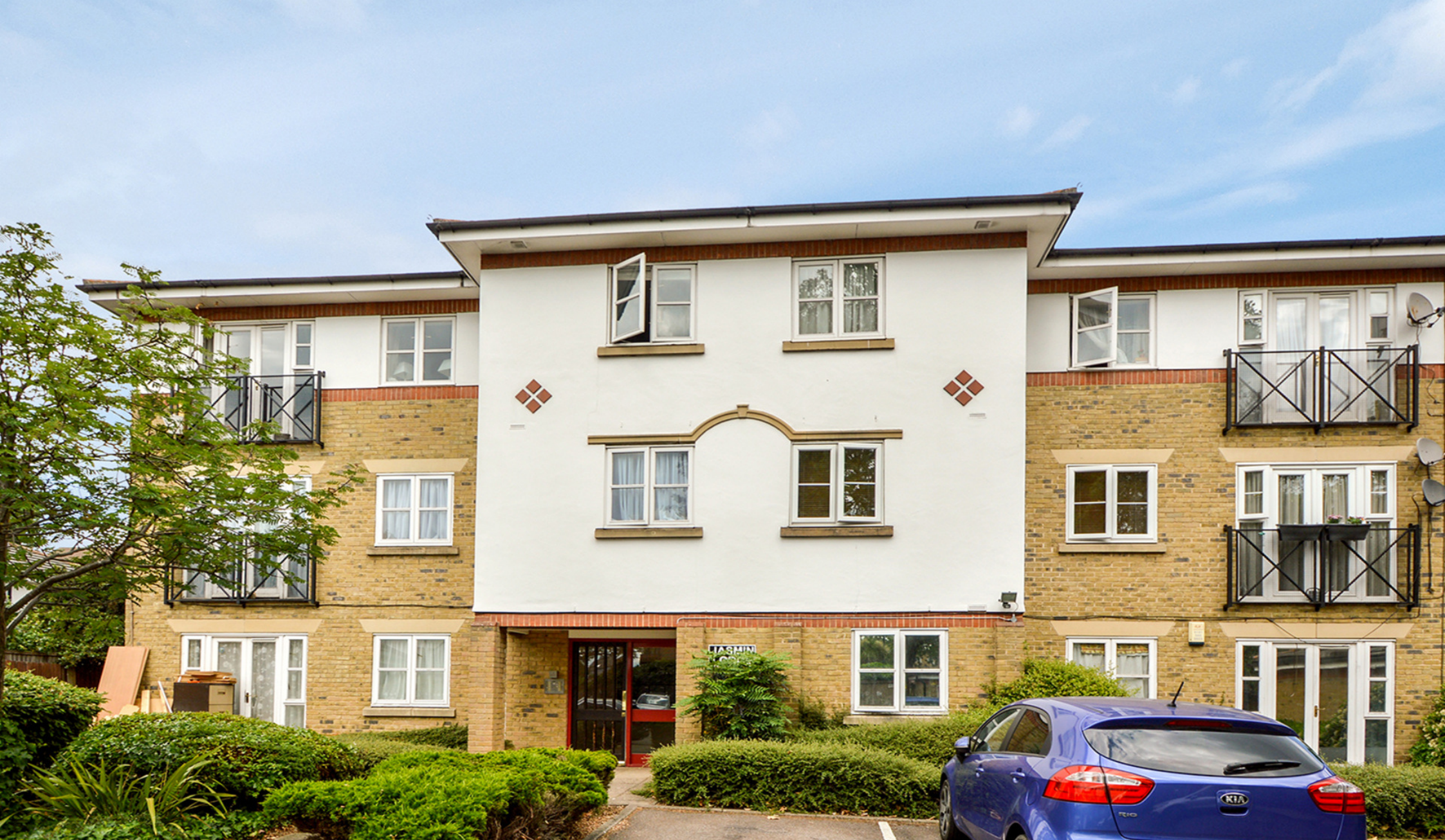
JASMIN LODGE SE16 2 bedroom apartment