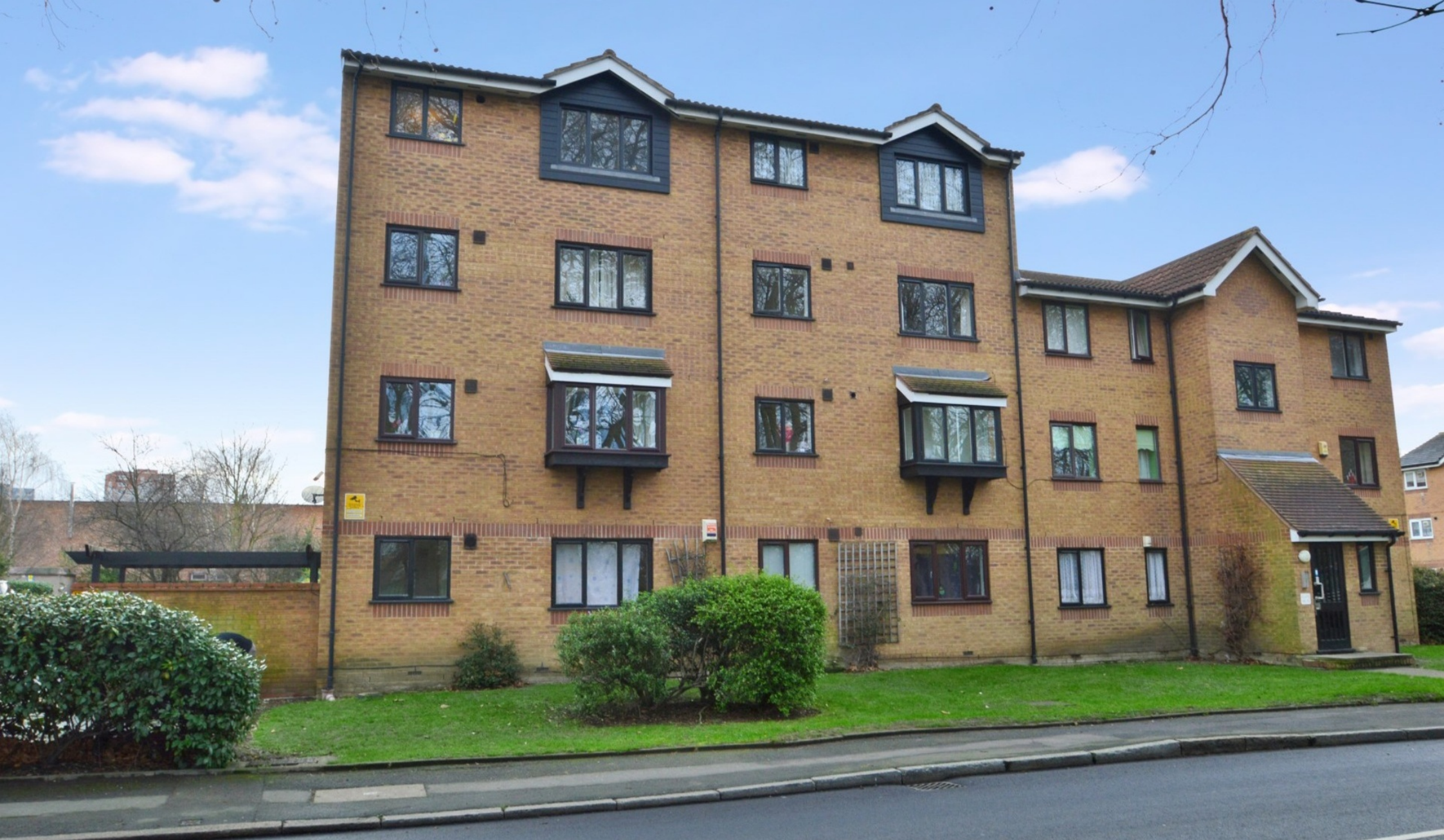
INWEN COURT SE8 studio apartment