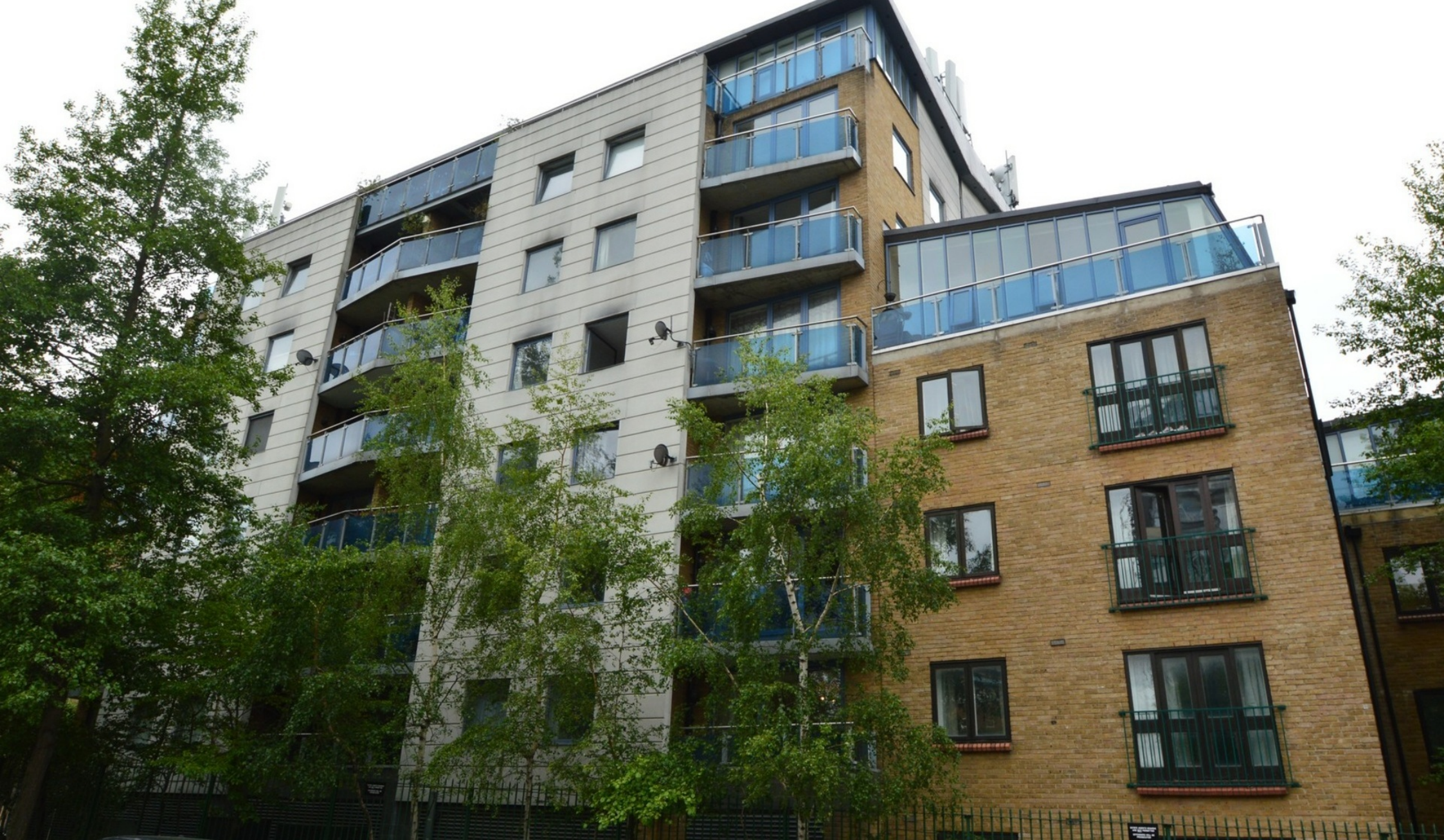
ICELAND WHARF SE16 2 bedroom apartment