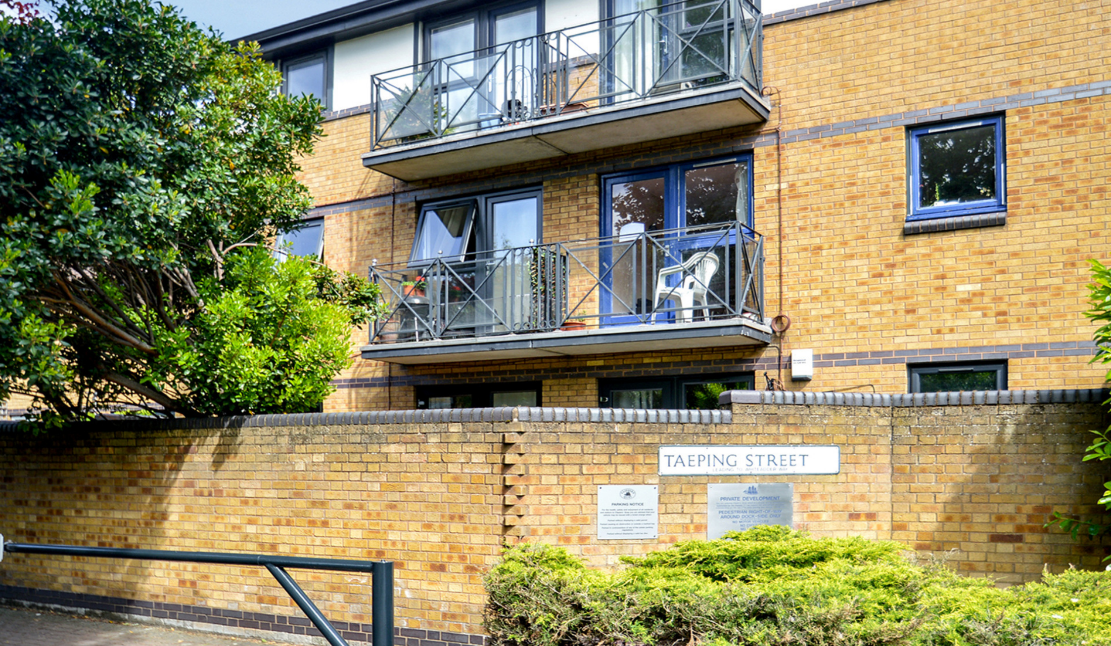
TAEPING STREET E14 2 bedroom apartment