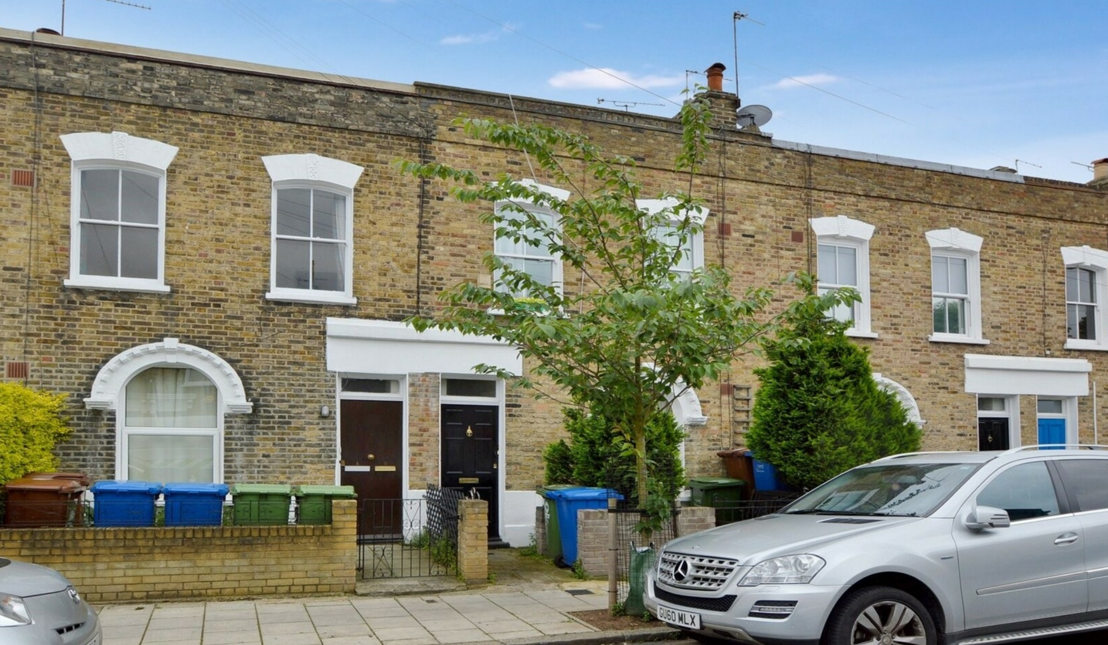
REVERDY ROAD SE1 1 bedroom apartment