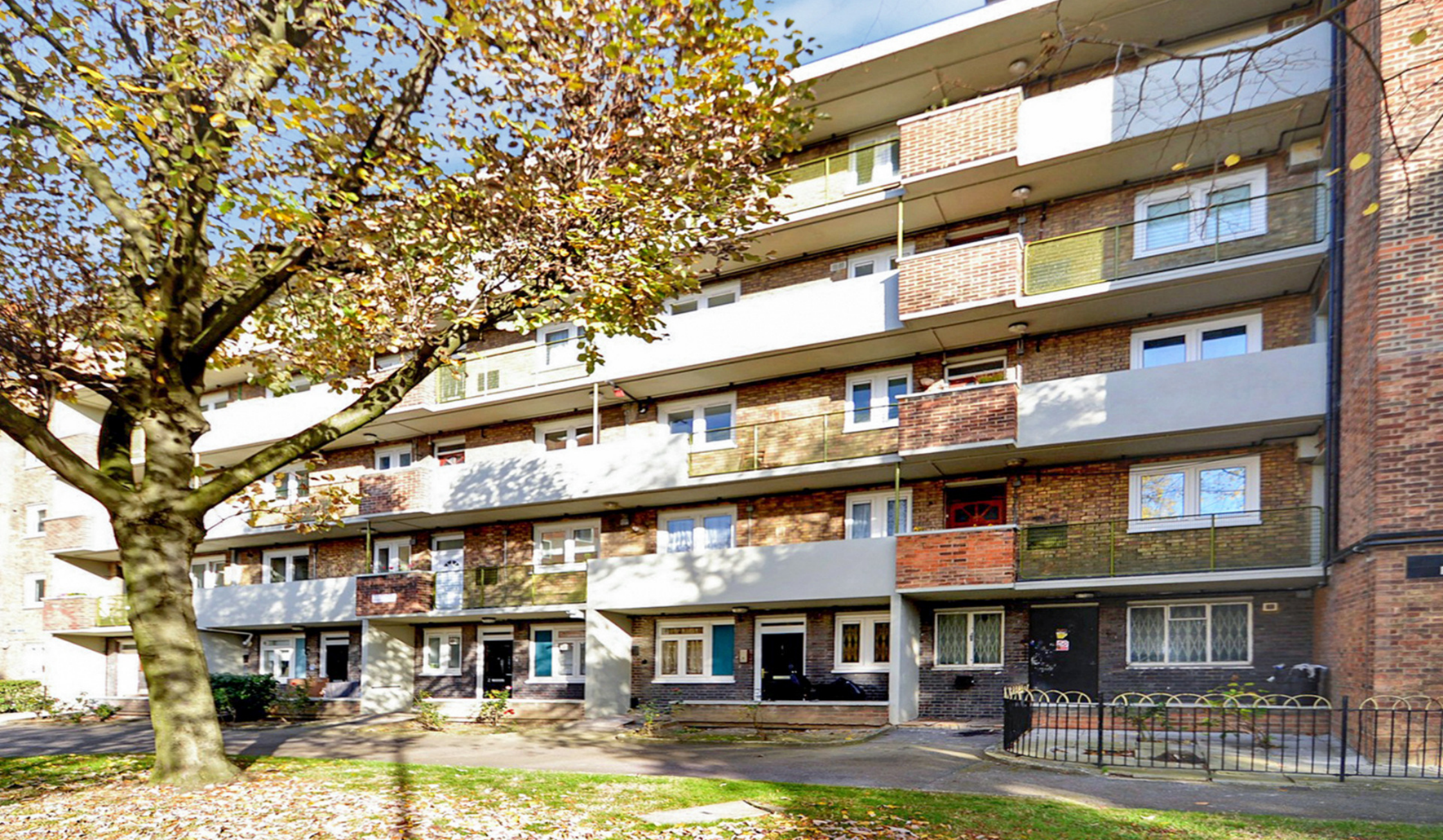
KEMP HOUSE E2 3 bedroom apartment