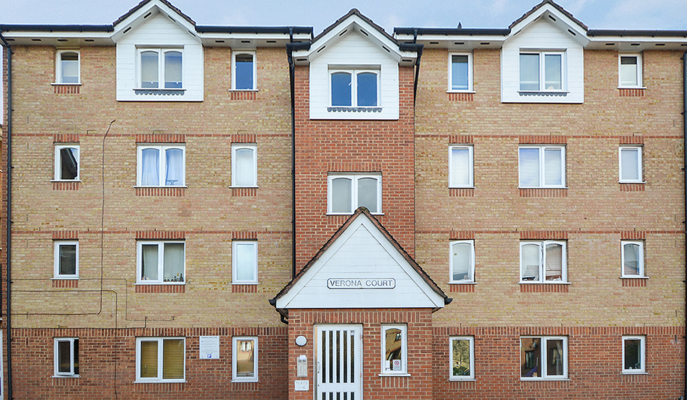
VERONA COURT SE14 studio apartment