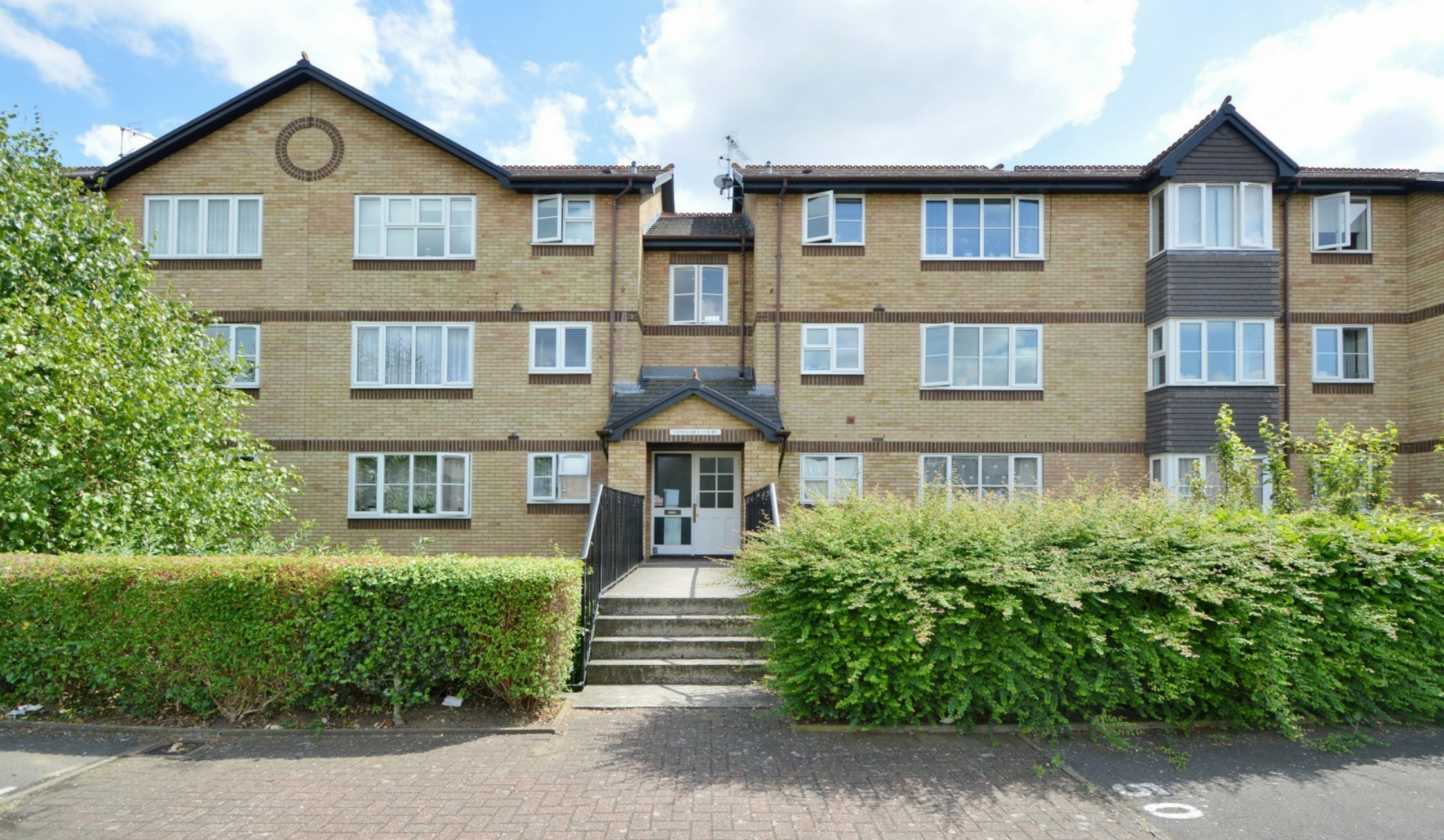
CONSTABLE COURT SE16 2 bedroom apartment