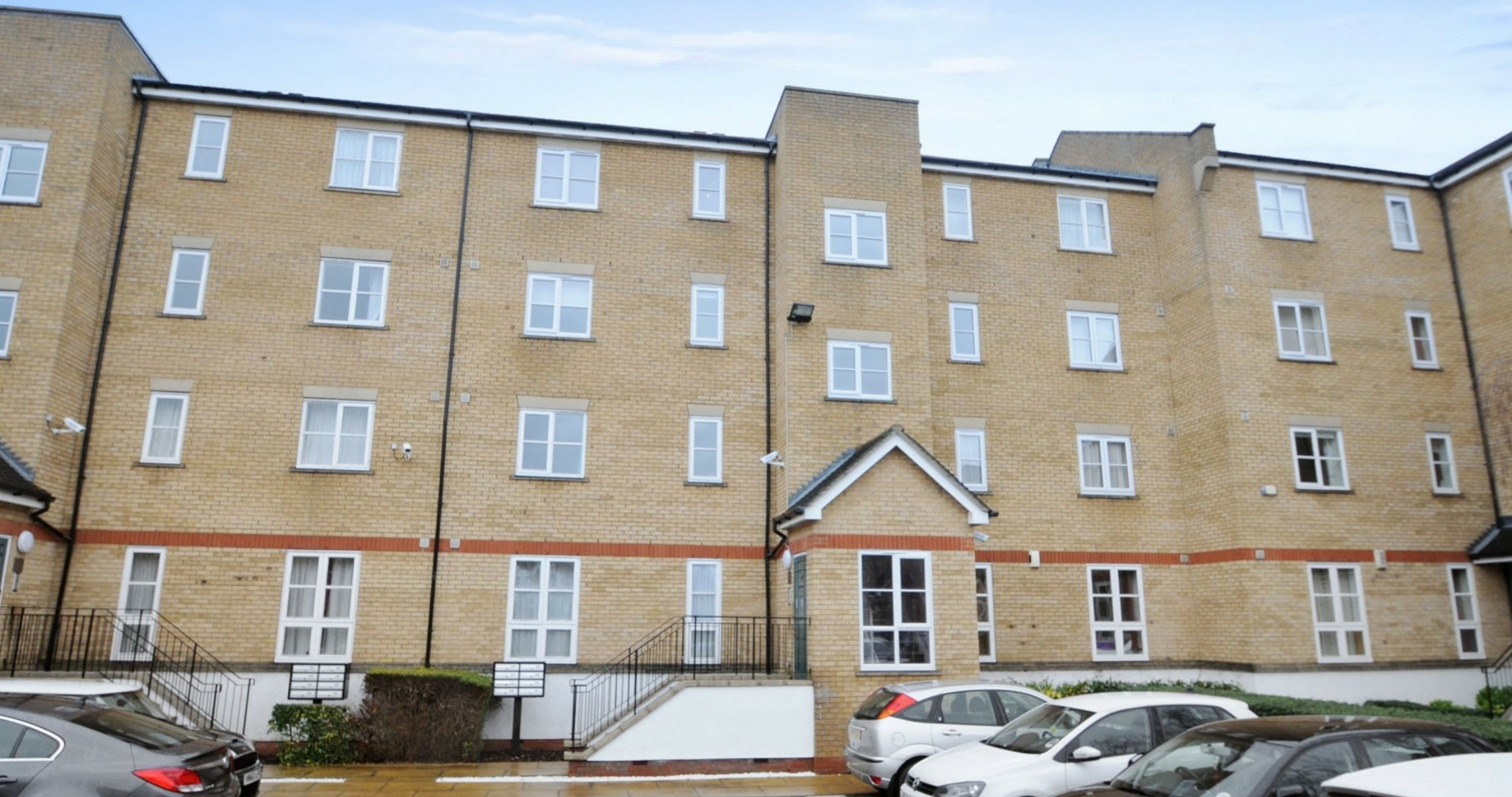
WHEAT SHEAF CLOSE E14 2 bedroom apartment