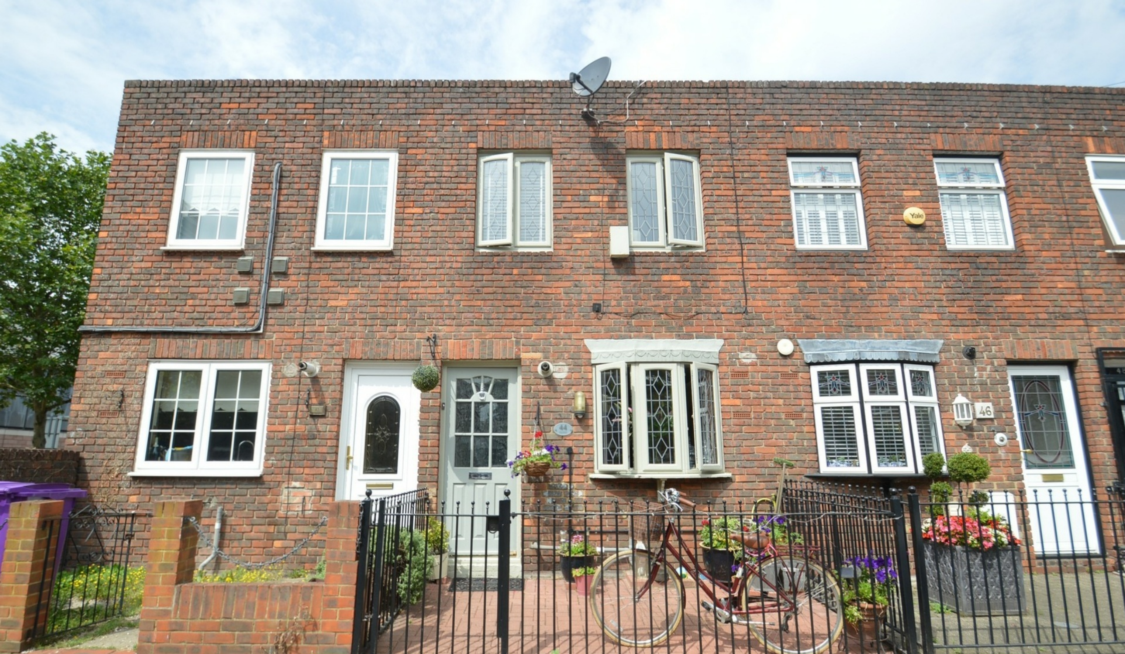
MING STREET E14 3 bedroom terraced house