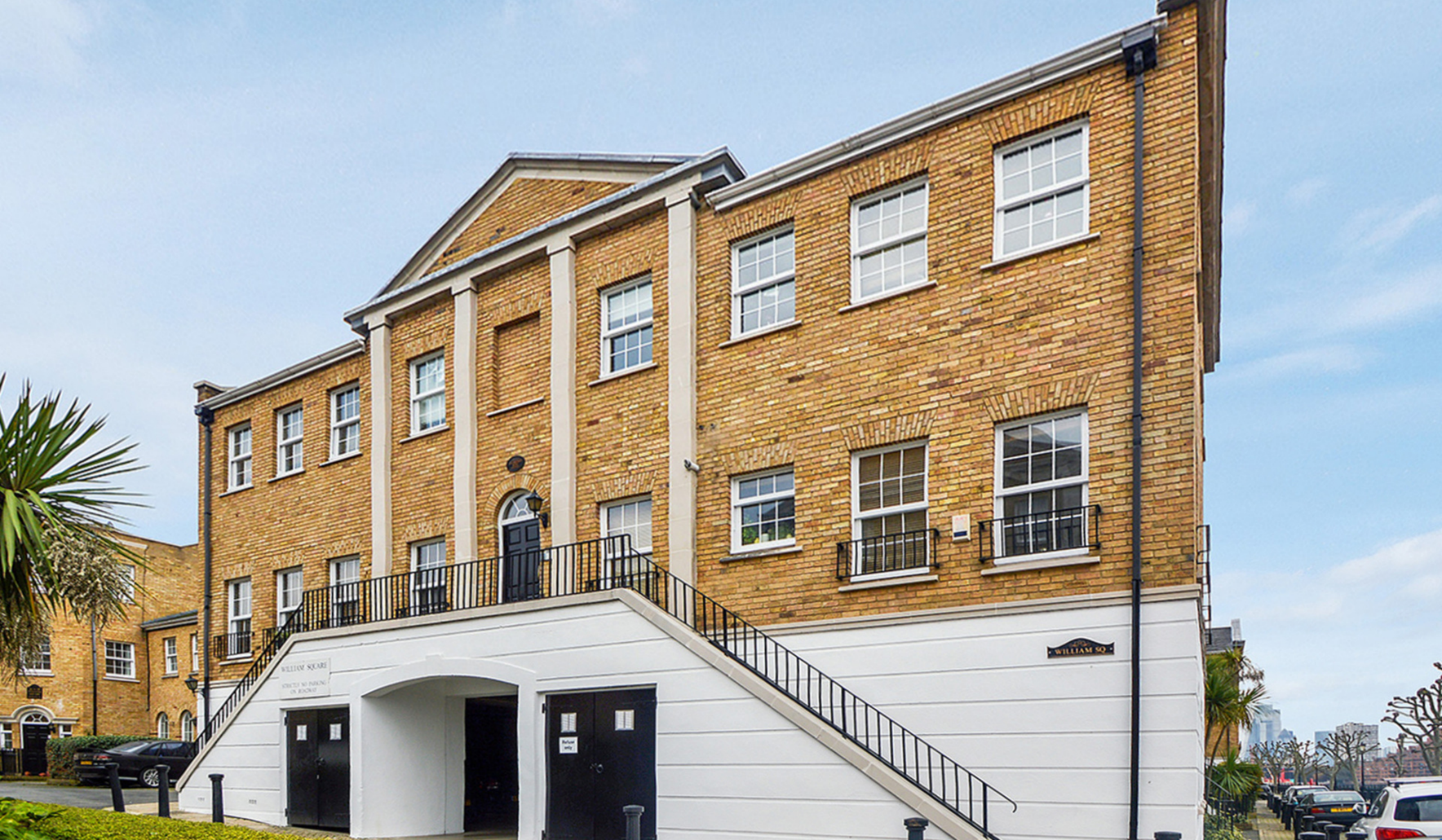
WILLIAM SQUARE SE16 2 bedroom apartment