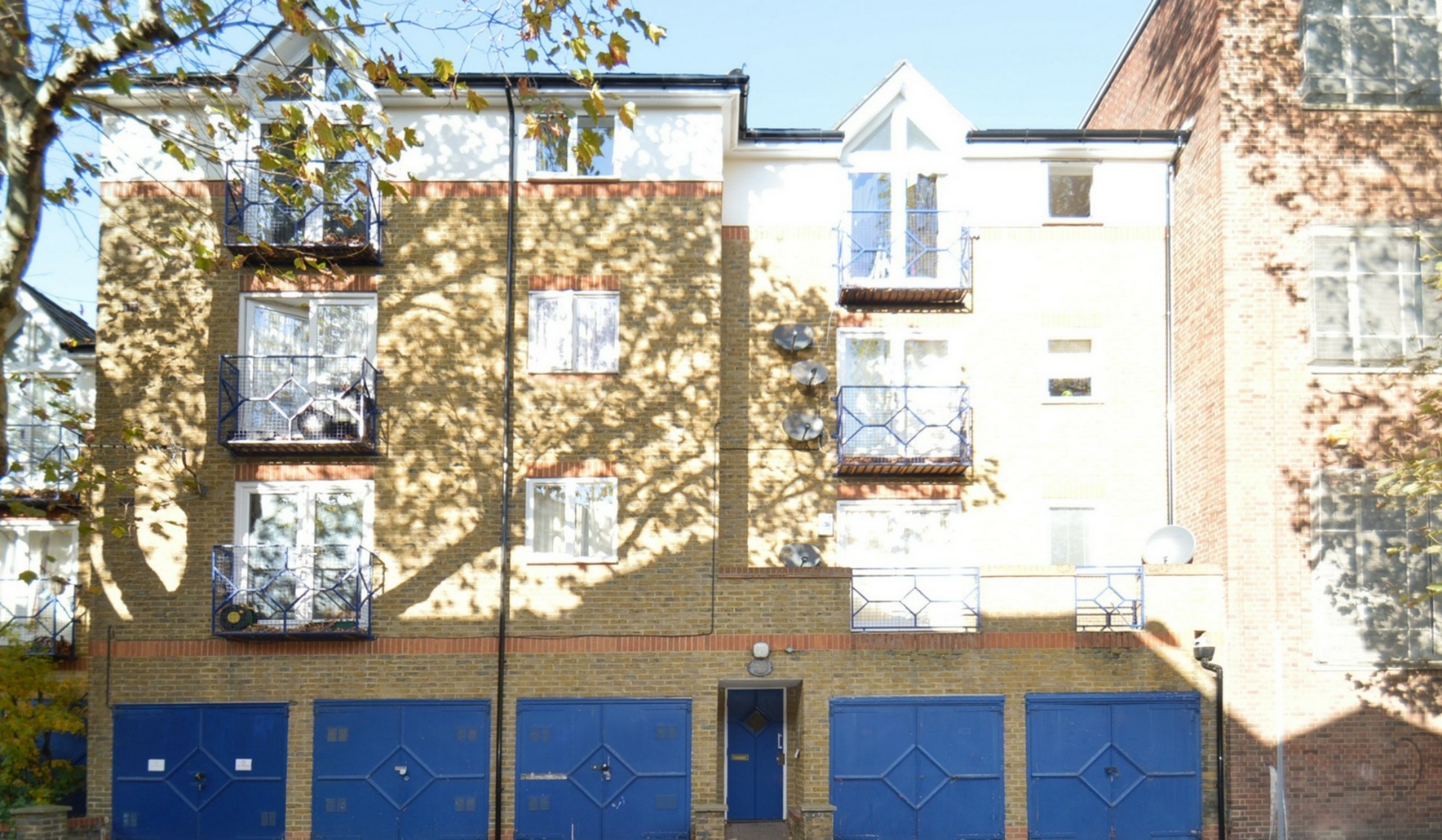
LIMETREE HOUSE SE8 1 bedroom apartment