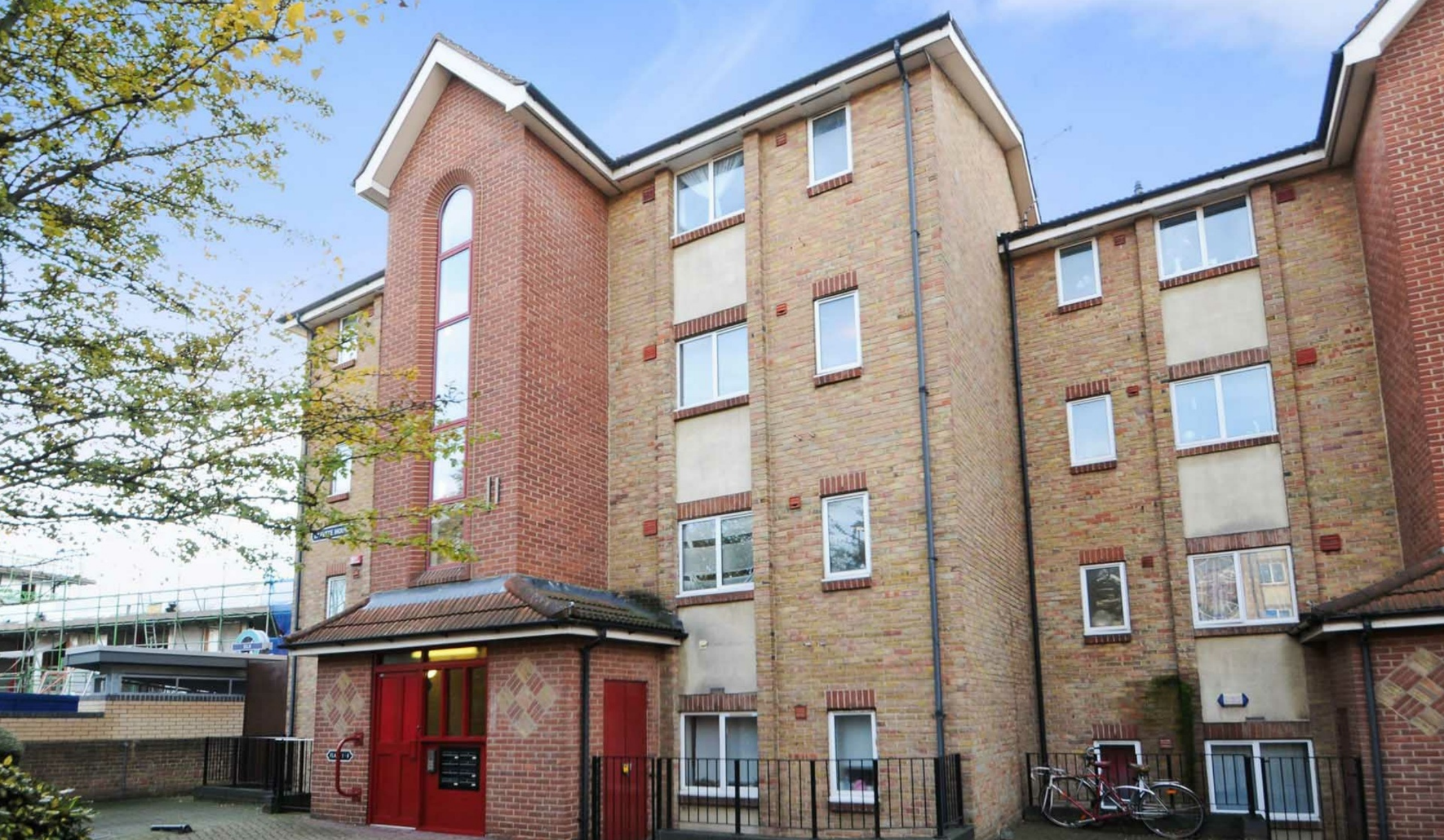
LAVETTE HOUSE E3 1 bedroom apartment