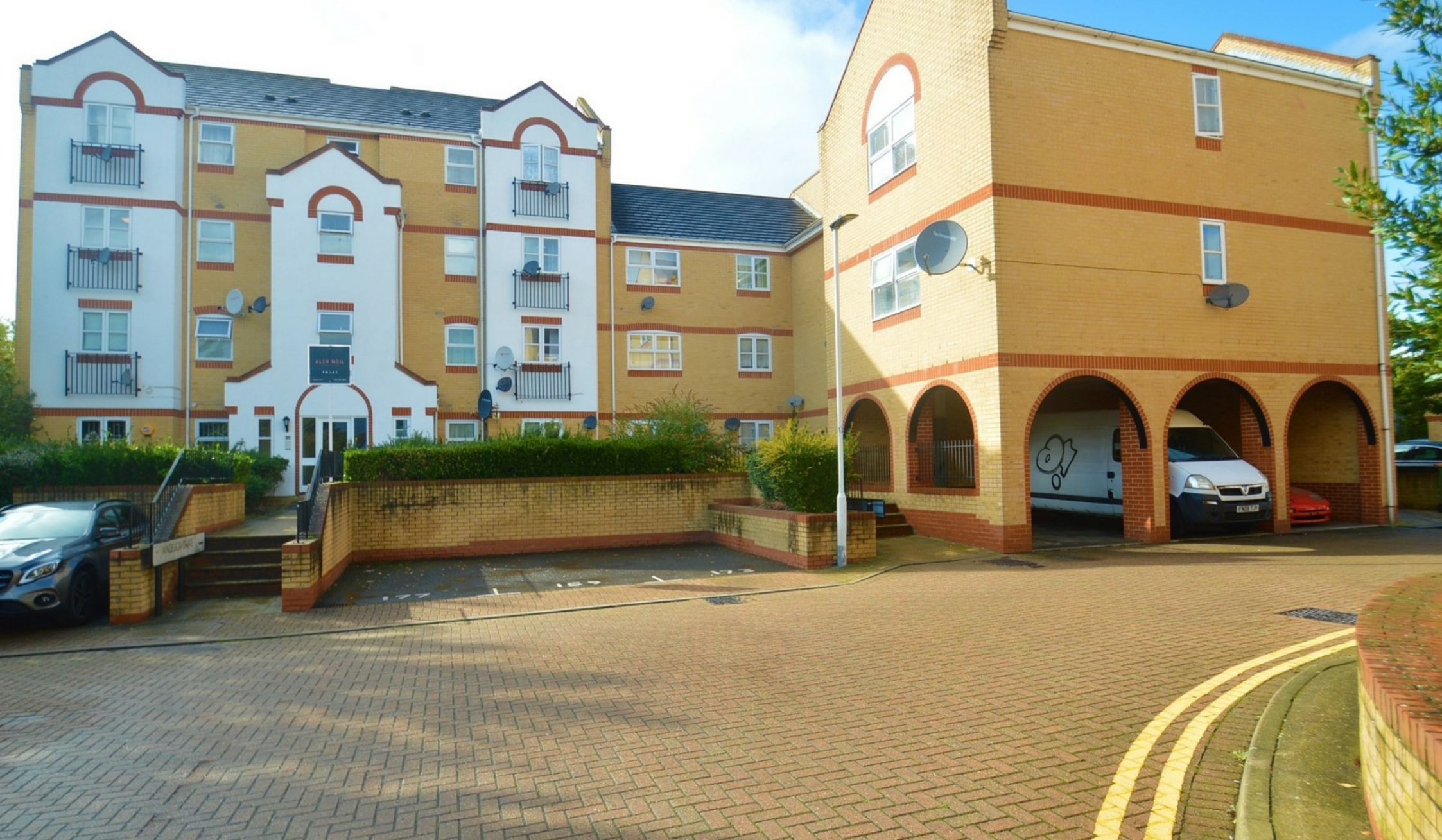
ANGELICA DRIVE E6 2 bedroom apartment