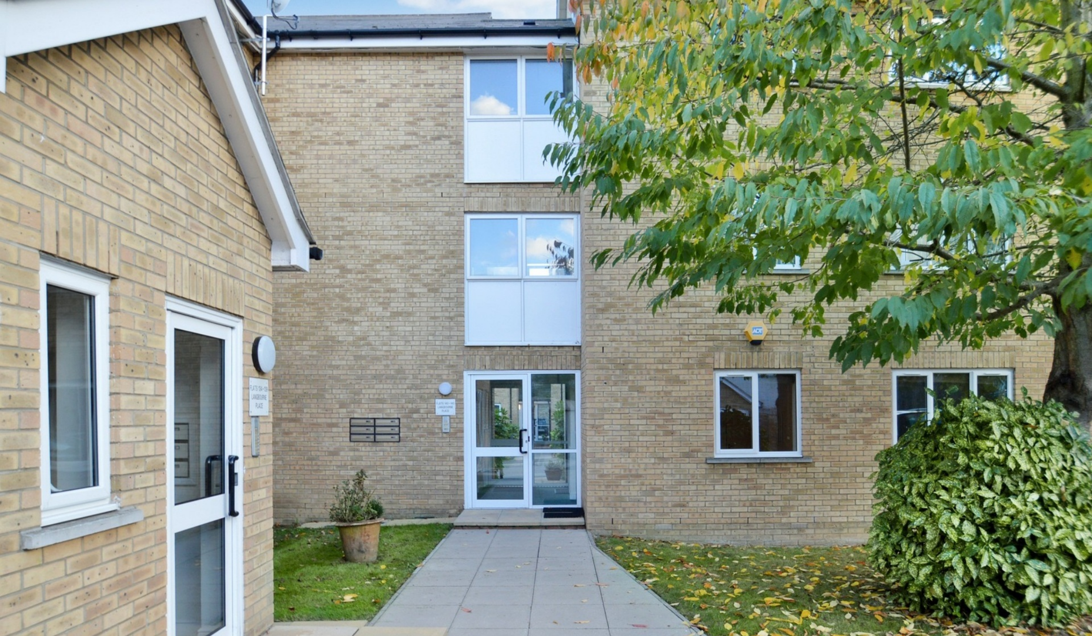
LANGBOURNE PLACE E14 2 bedroom apartment