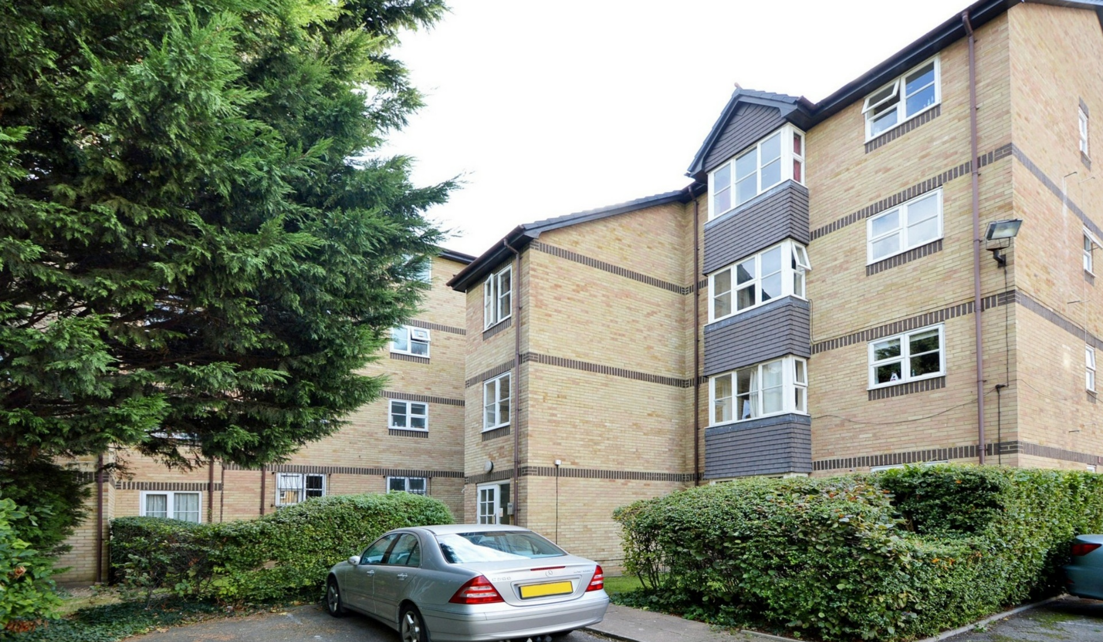
LOWRY COURT SE16 studio apartment