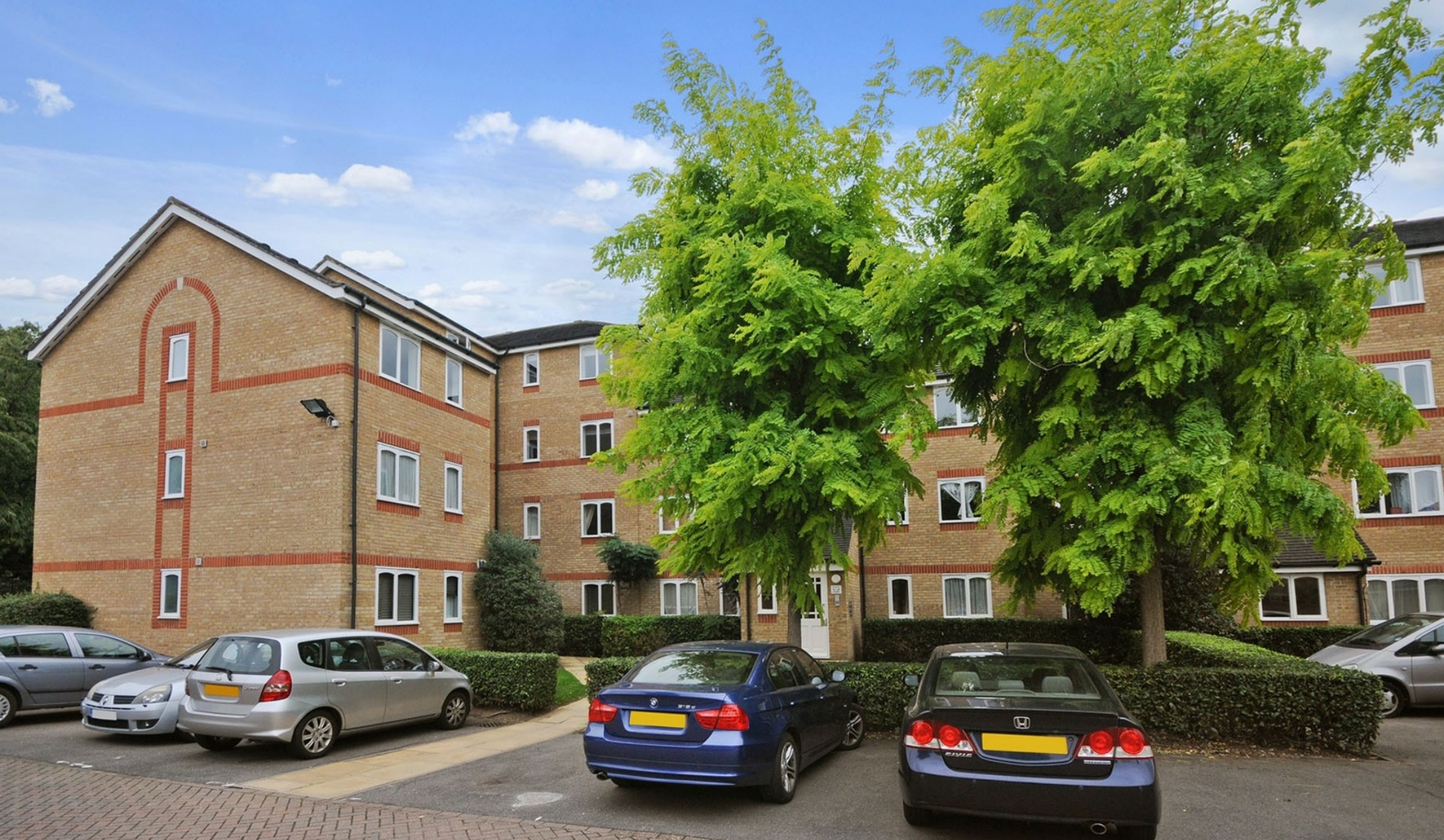
TELEGRAPH PLACE E14 2 bedroom apartment