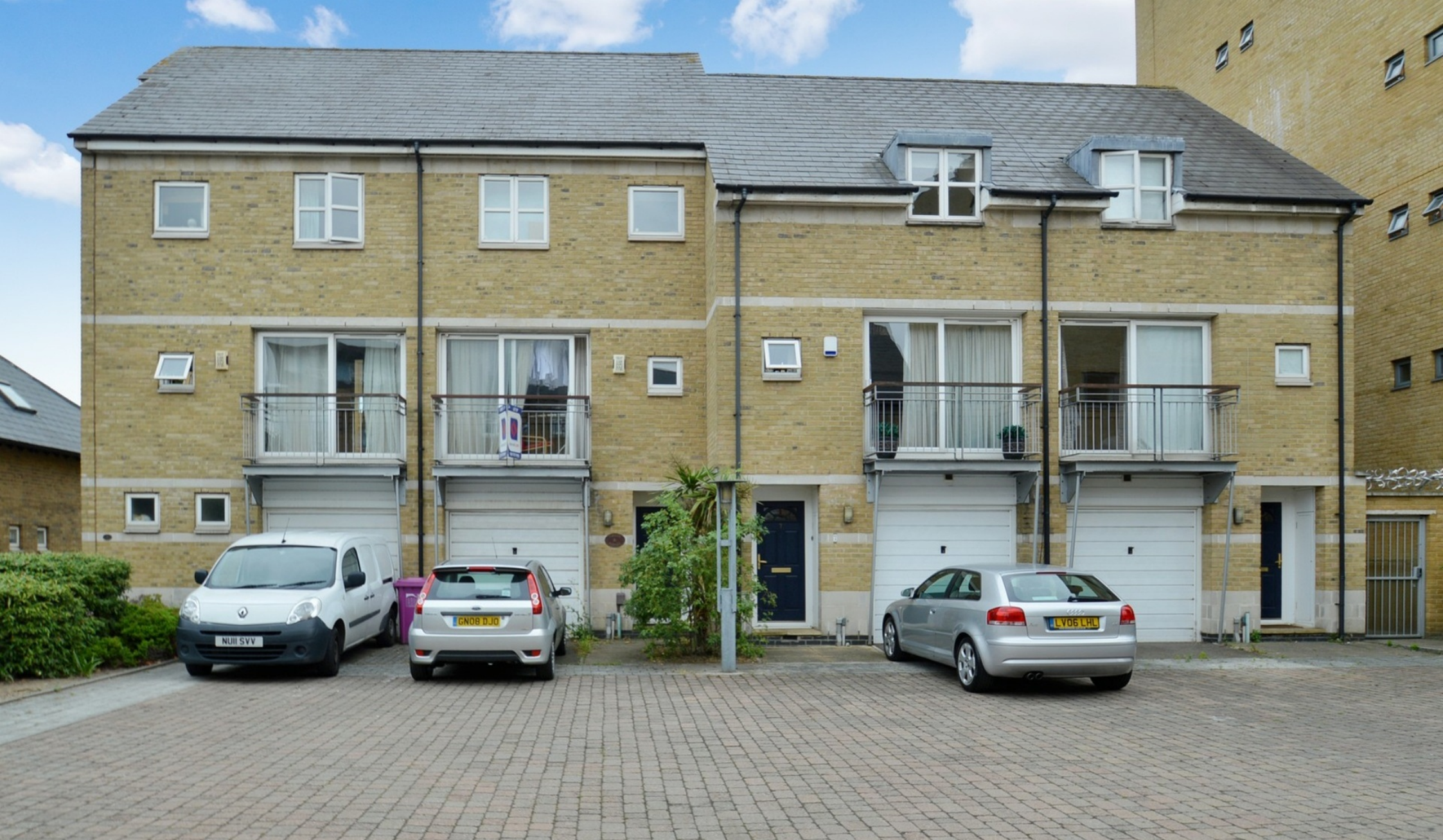
TORRES SQUARE E14 4 bedroom town house