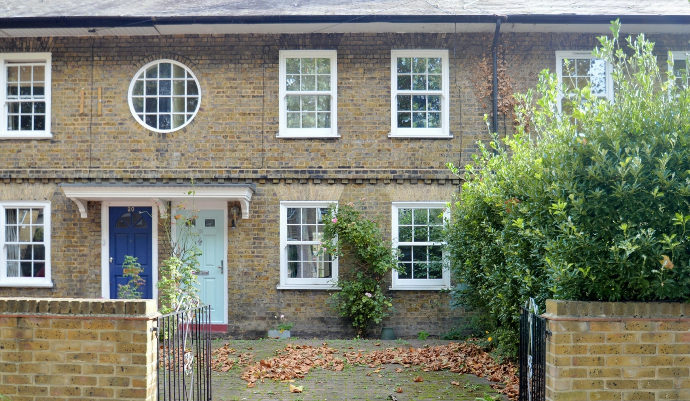
THERMOPYLAE GATE E14 2 bedroom terraced house