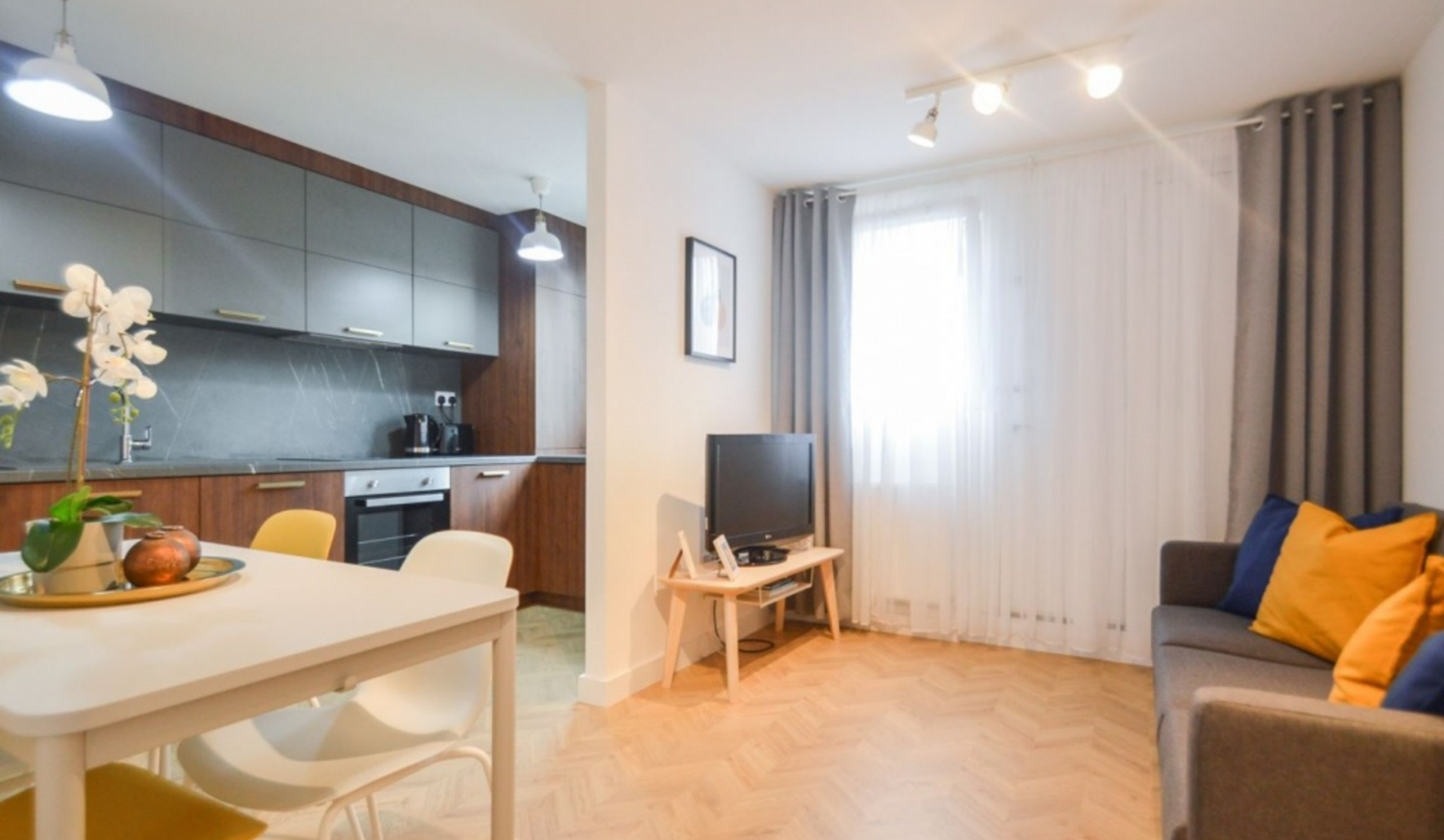
SPINNAKER HOUSE E14 4 bedroom apartment