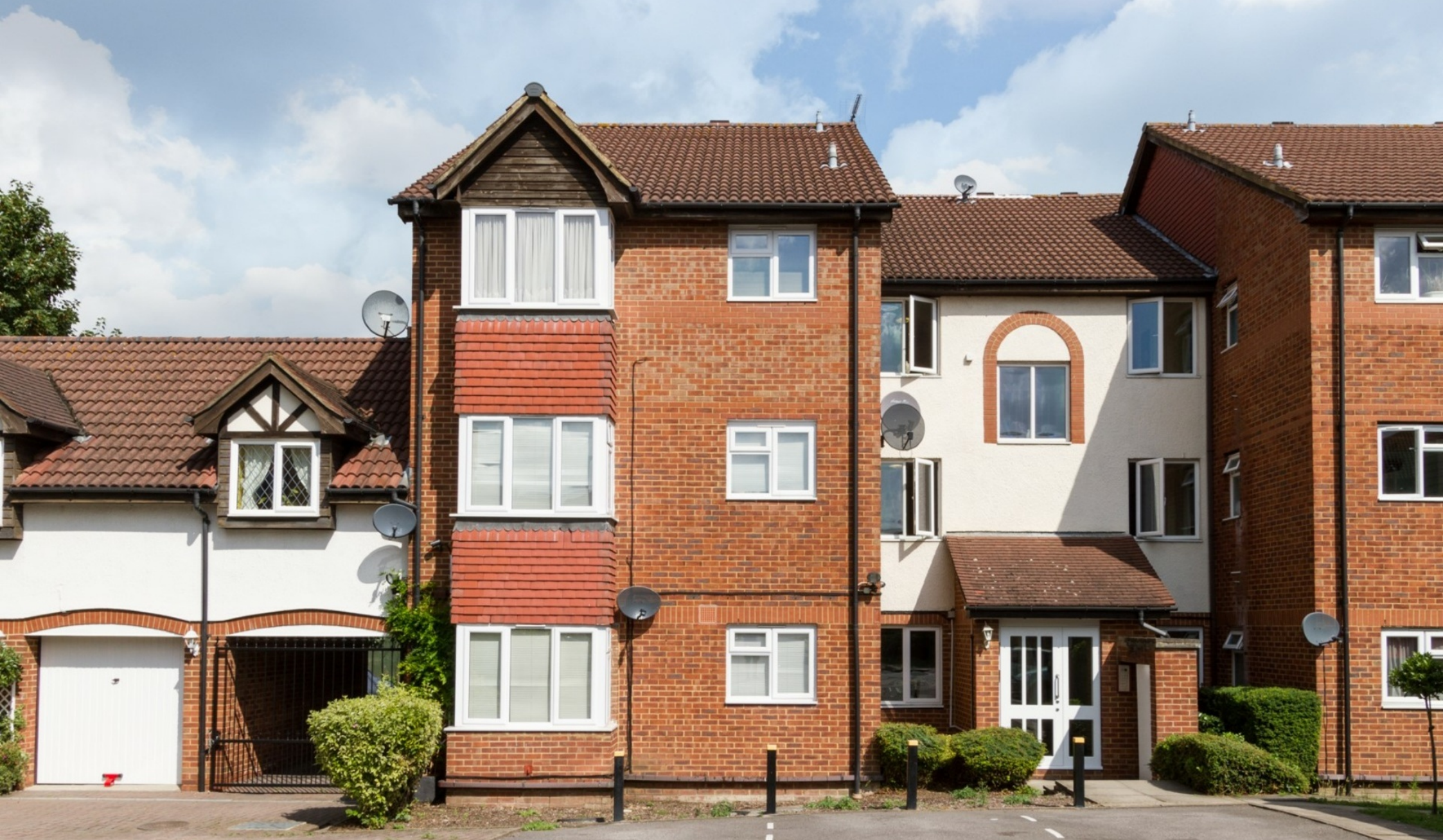
STERLING GARDENS SE14 1 bedroom apartment