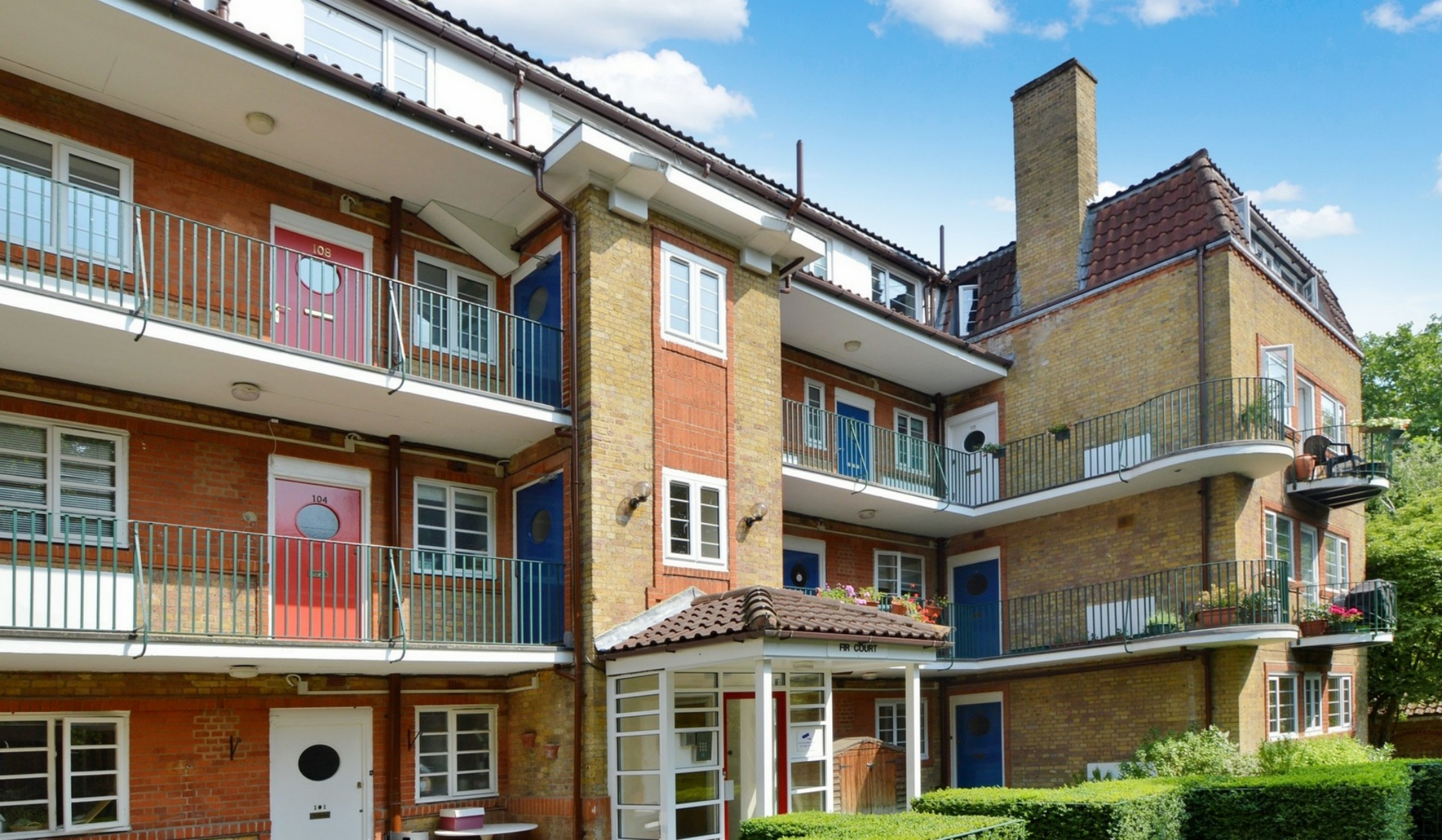
ACORN WALK SE16 2 bedroom apartment