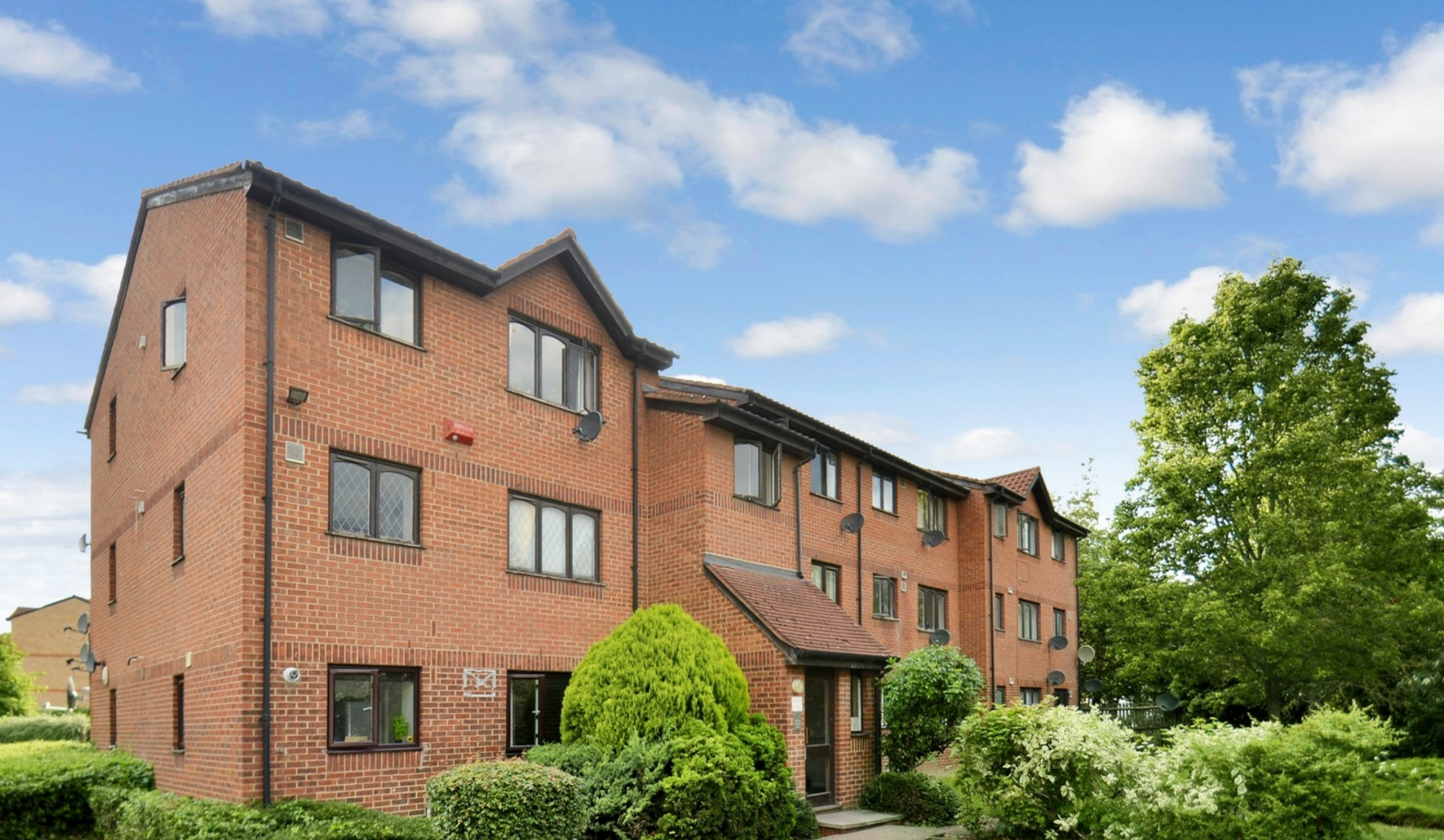
BRIDGE MEADOWS SE14 studio apartment