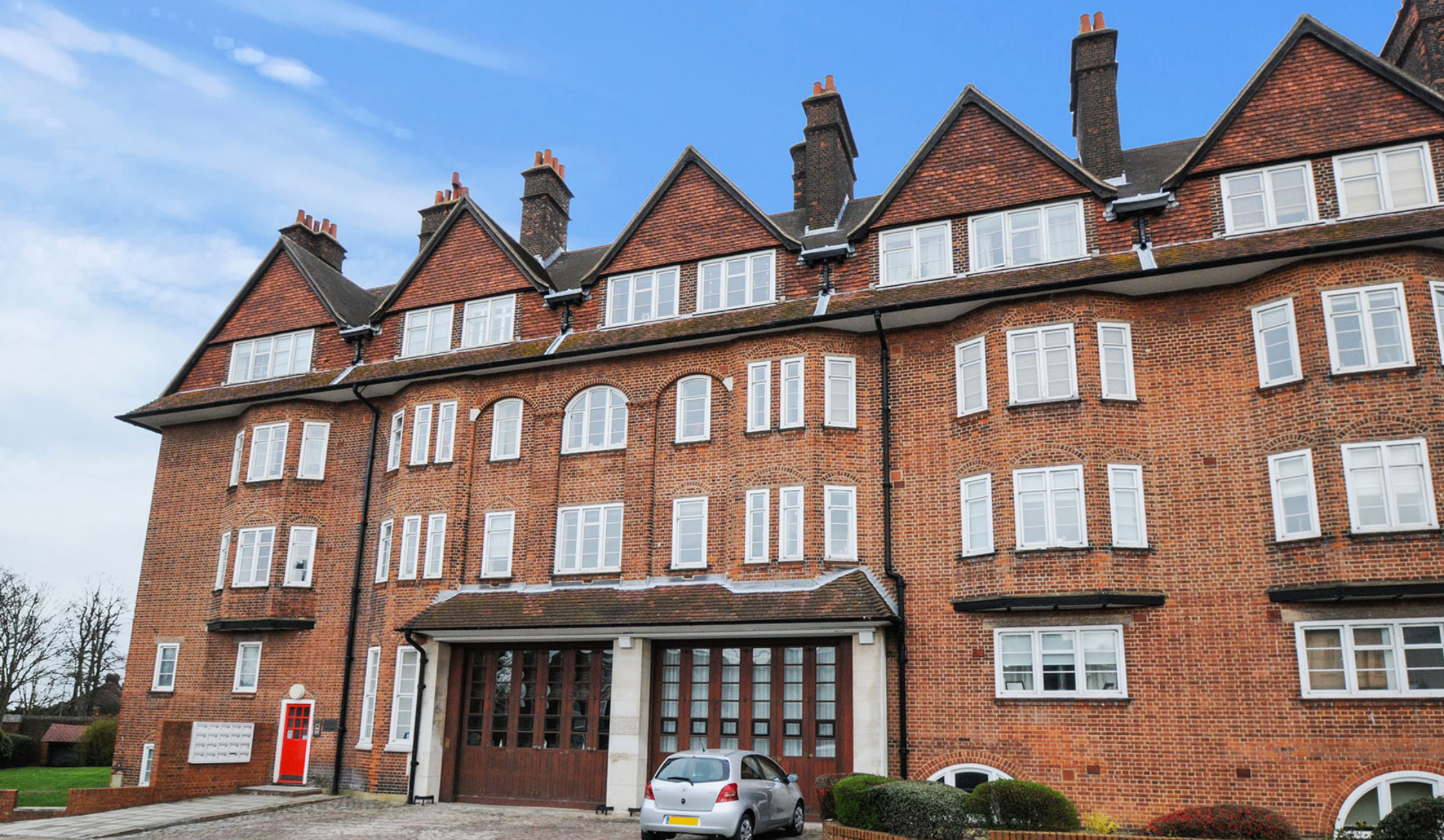
THE OLD FIRE STATION SE18 2 bedroom apartment