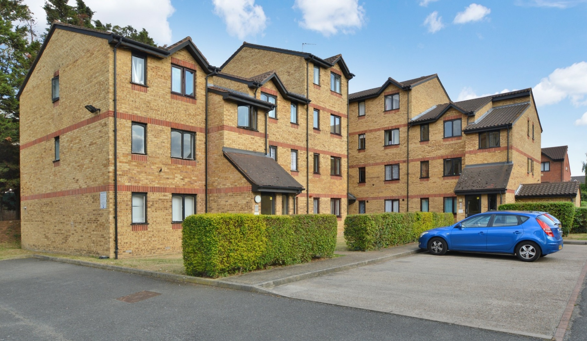
DONNE HOUSE SE14 1 bedroom apartment