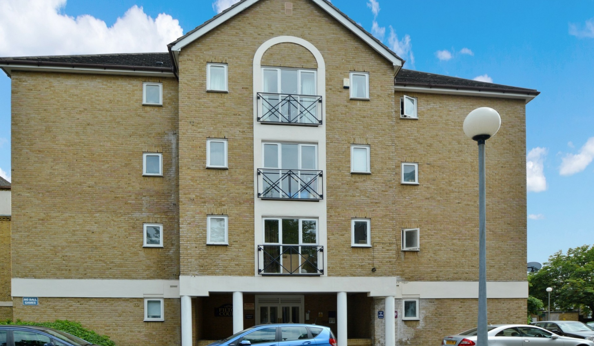
FILTON COURT SE14 1 bedroom apartment