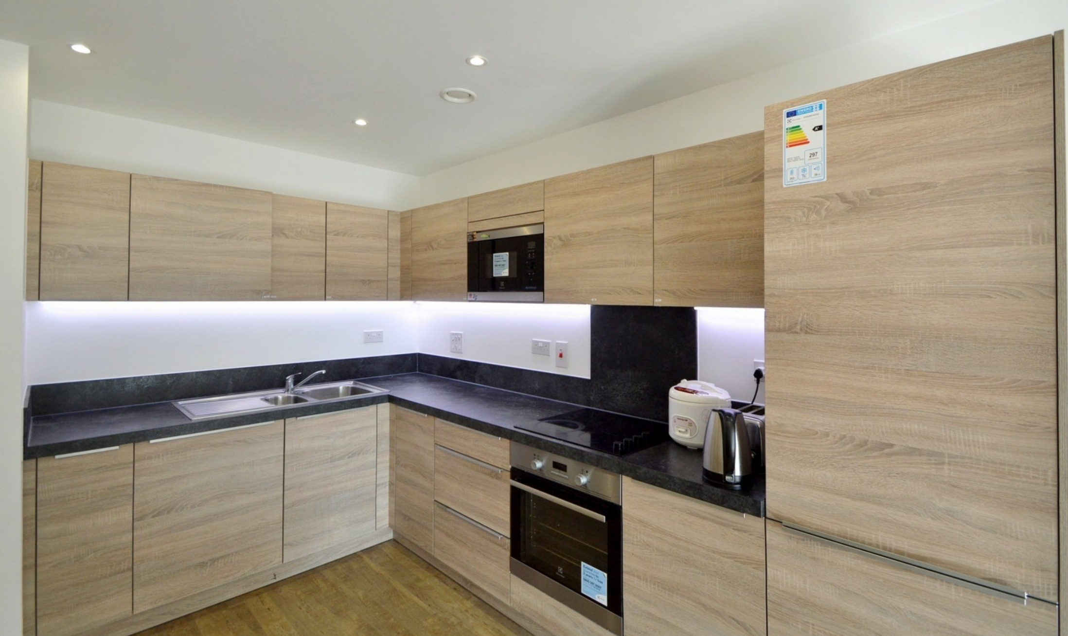
COPENHAGEN COURT SE8 3 bedroom apartment